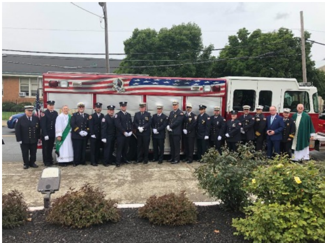
Blue Mass at Sacred Heart