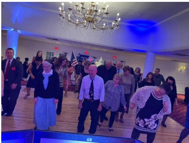
Dancing the night away at the Columbus Day Ball.