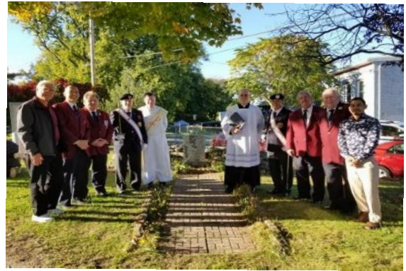
The re-dedication ceremony of the Knights of Columbus, Council 444 Monument to the Unborn