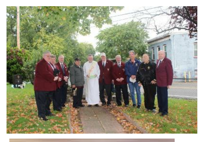
Re-dedication of the monument to the unborn