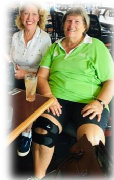
Waiting to play scroungers

really enjoyed about teaching in England was the holidays – they have more than Queensland does! So we had lots of opportunities to go away. I had begun to play bowls in 2001 at the now defunct RSL Bowls Club, formerly Caloundra West. Bowls took a back seat while we were away, but once I retired I became serious about it. I joined Caloundra Club in 2010 when my old club closed, and have enjoyed my time here. One thing that amazed me when I joined Caloundra was the number of club members from my first home of Rockhampton, and also from nearby Mt. Morgan. The Waves Caloundra Bowls Club has provided me with friendship, learning new skills and feeling part of a special community. I hope we can move on to bigger and better prospects with the changes that are starting to happen in the club".