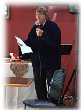
Entertaining us with hilarious skits.