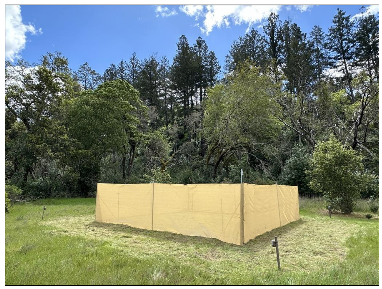
Fig 3. Final product - the first Shade Cloth Puma Proof Experimental Pen.

Since mountain lions move through vast areas of their territories and we currently have diminished numbers, it may be a while before we see one on the cameras. Until then, we will wait and see!