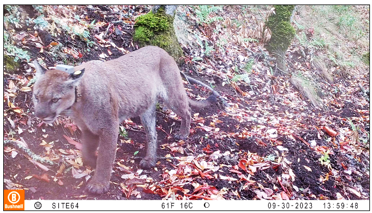
Fig 1. P13, the last male we were tracking, died 29 April 2024 (Photo:Audubon Canyon Ranch Trail Camera Project).