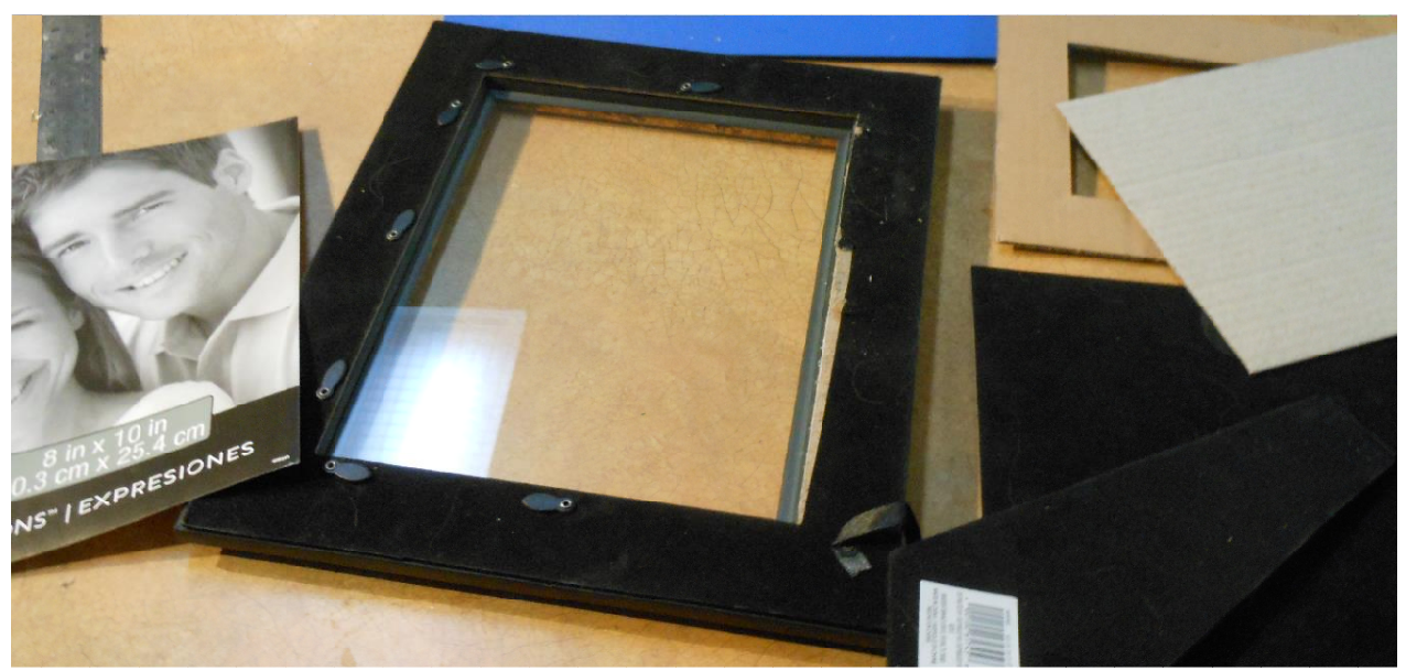
Parts of the Frame