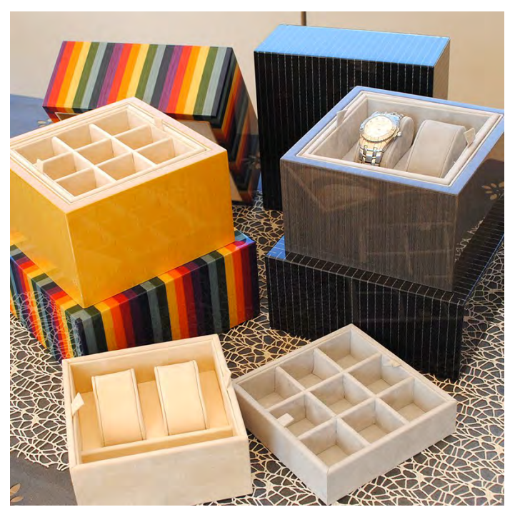
PACKAGING: RIGID BOX + FABRIC BAG