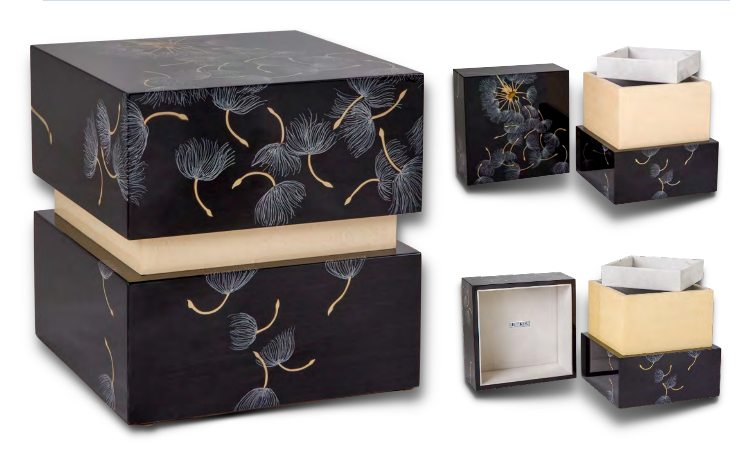
*The Dandelion Model is only available in the DELUXE CUBE version (not Premium or Keepsake version).