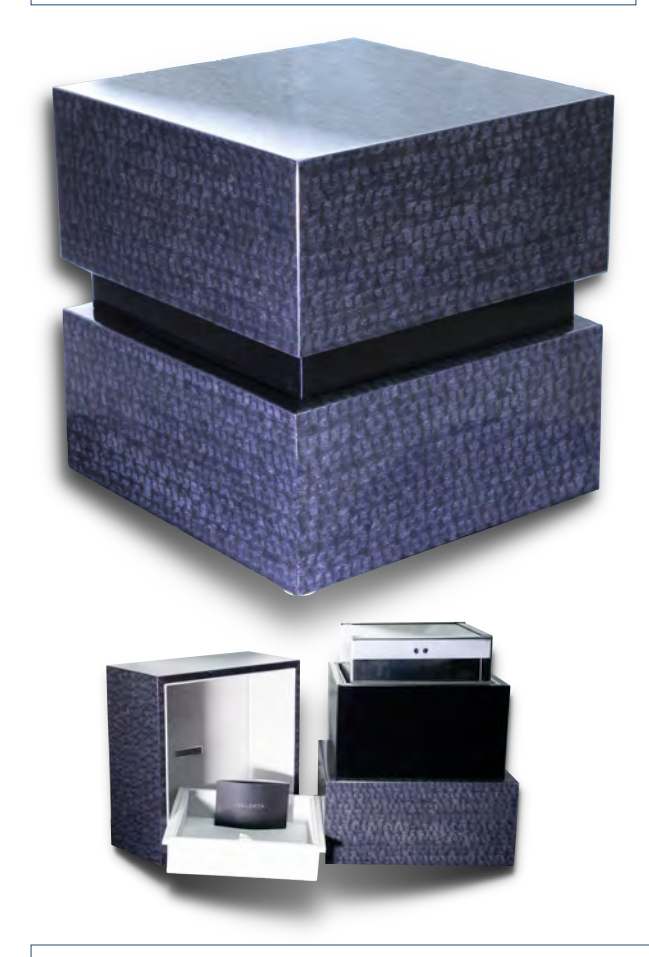
DELUXE PRISMA GRACE BASKET