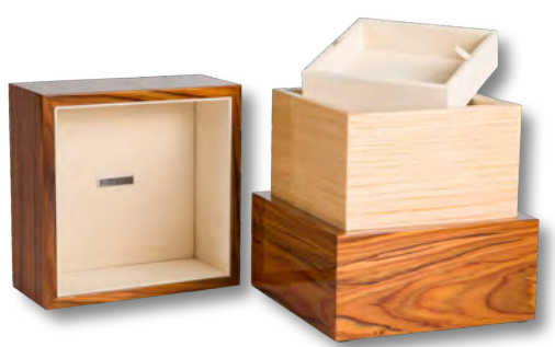
DELUXE CUBE JOY