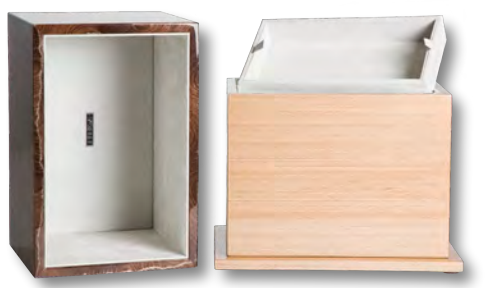
DELUXE PRISM GIORGIO