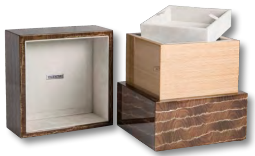
DELUXE CUBE GIORGIO