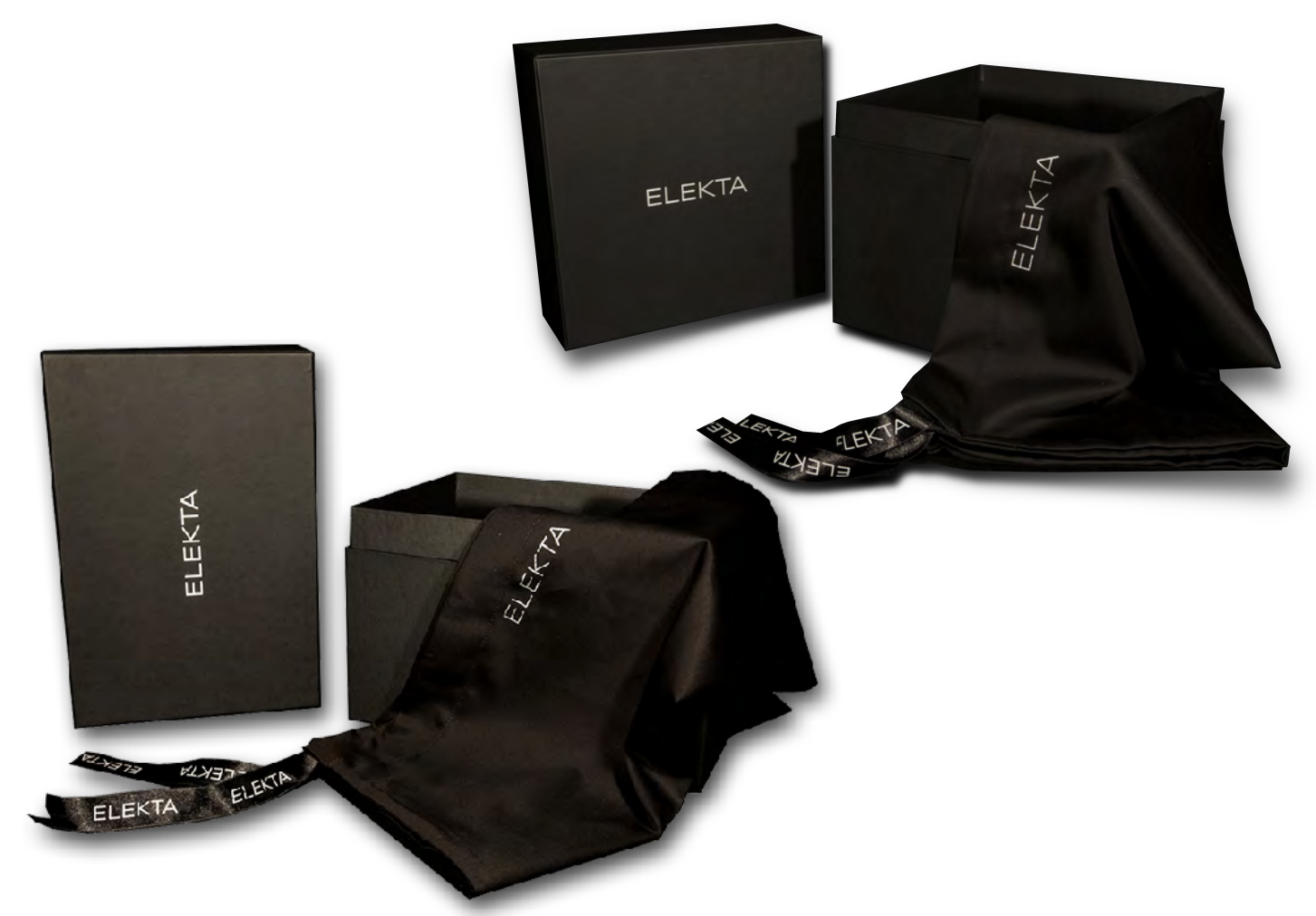
*PACKAGING available for the entire ELEKTA Urns Line (DELUXE Models - PREMIUM Models - KEEPSAKE & PET Models).