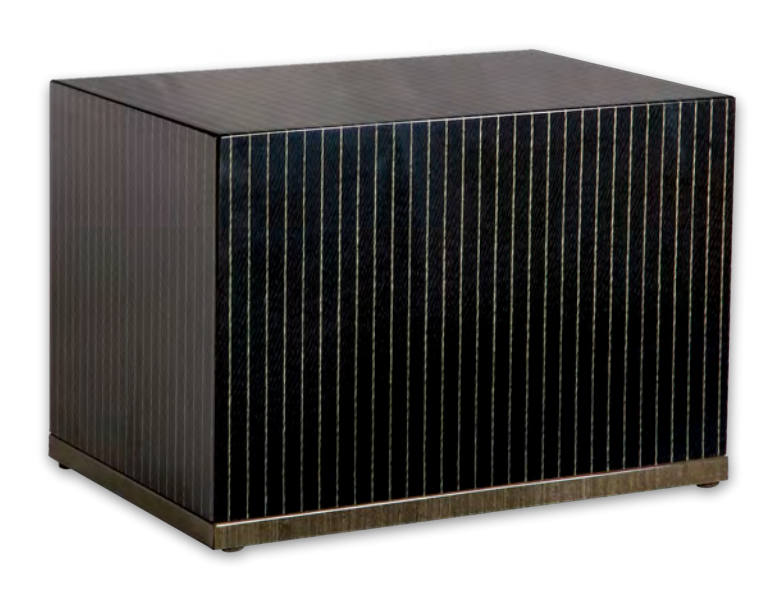
PREMIUM PRISM GRACE BLUE