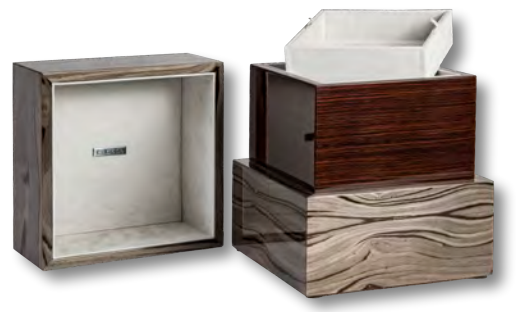
DELUXE CUBE GLAMOUR