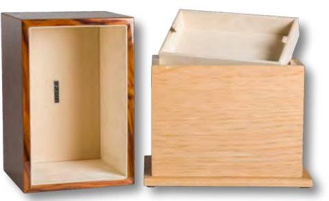
DELUXE PRISM JOY