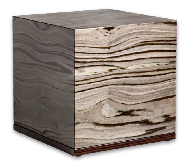
PREMIUM CUBE GIORGIO