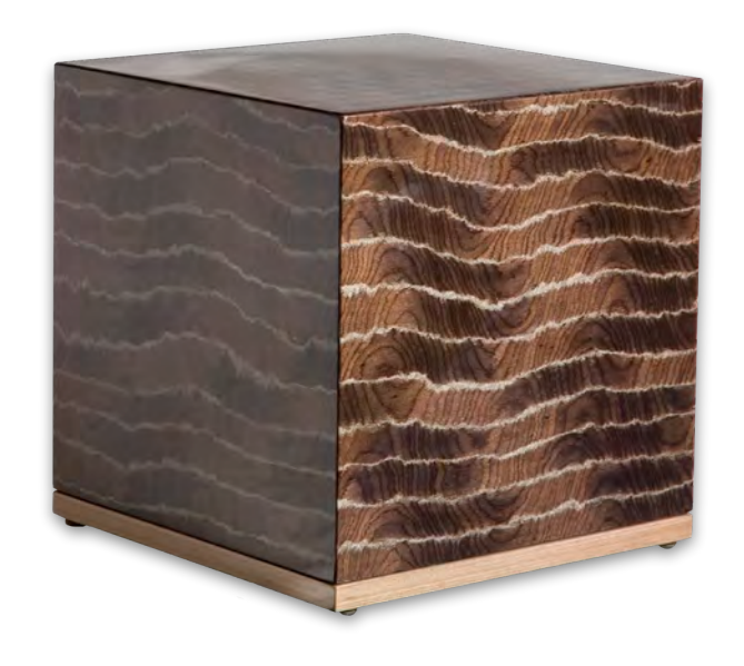
PREMIUM CUBE PURE