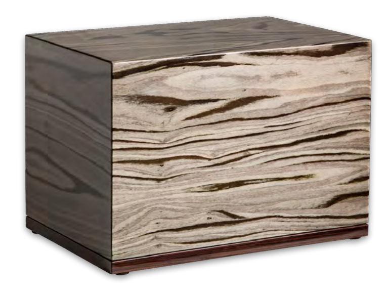
PREMIUM PRISM GIORGIO