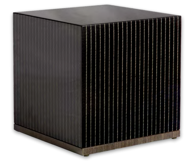
PREMIUM CUBE GRACE BLUE