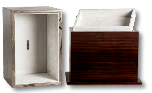
DELUXE PRISM GLAMOUR