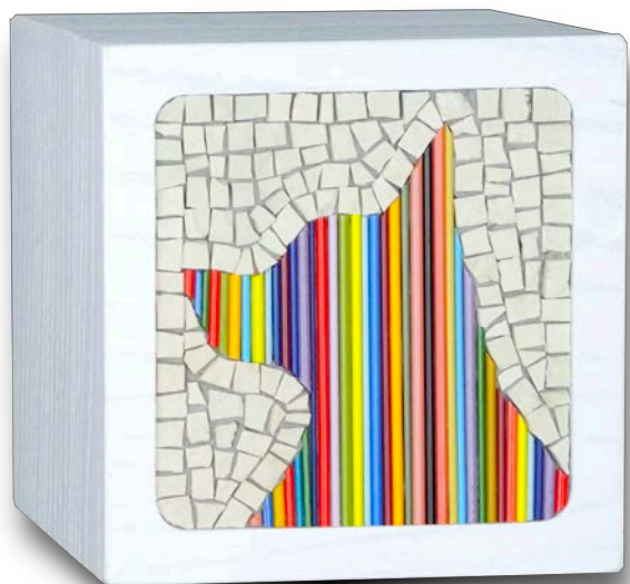
PET URN WITH POP DOG MOSAIC (3PPD)