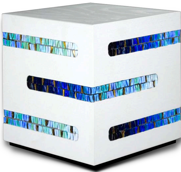
CUBE URN WITH BLUE MOSAIC (code 5MPB)