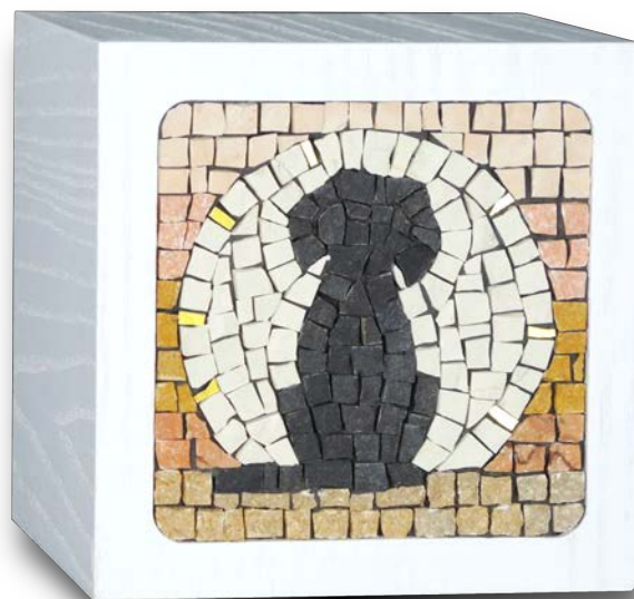
PET URN WITH CLASSIC DOG MOSAIC (4PCD)