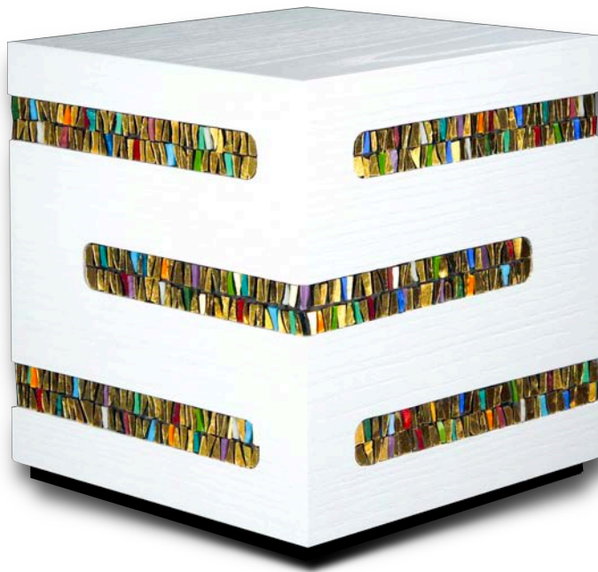
CUBE URN WITH GOLD MOSAIC (code 4MPG)