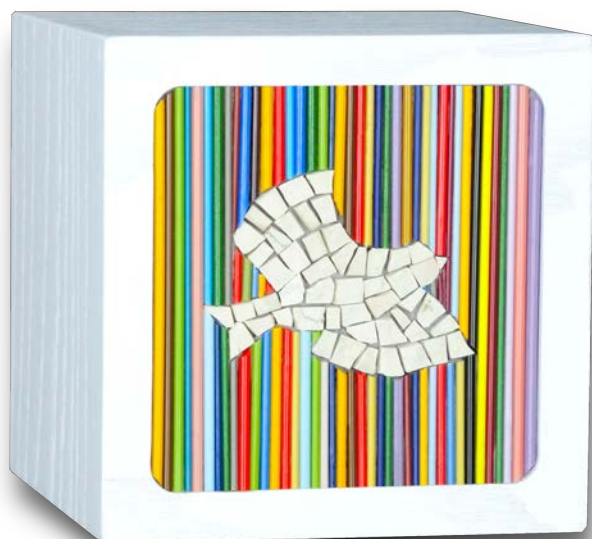
PET URN WITH POP BIRD MOSAIC (5PPB)