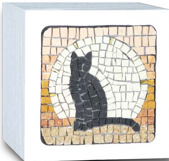
PET URN WITH CLASSIC CAT MOSAIC (2PCC)