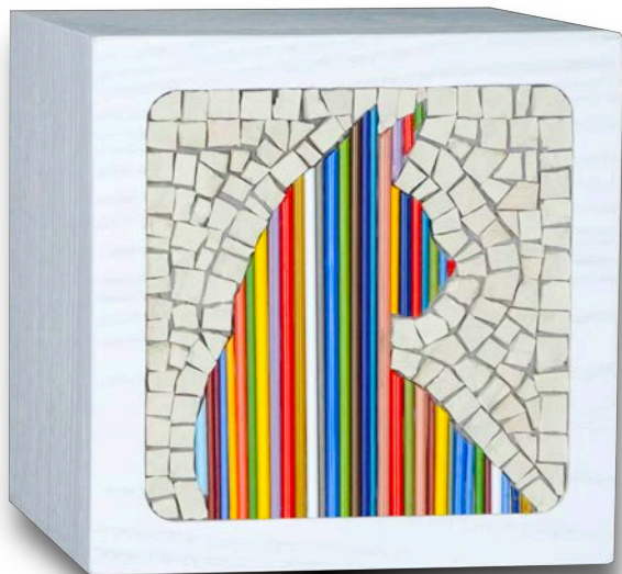
PET URN WITH POP CAT MOSAIC (1PPC)