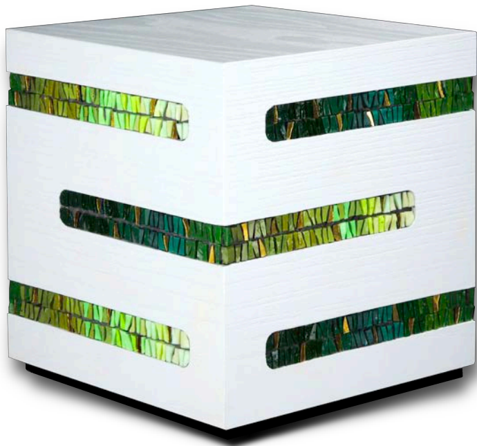
CUBE URN WITH GREEN MOSAIC (code 3MPG)