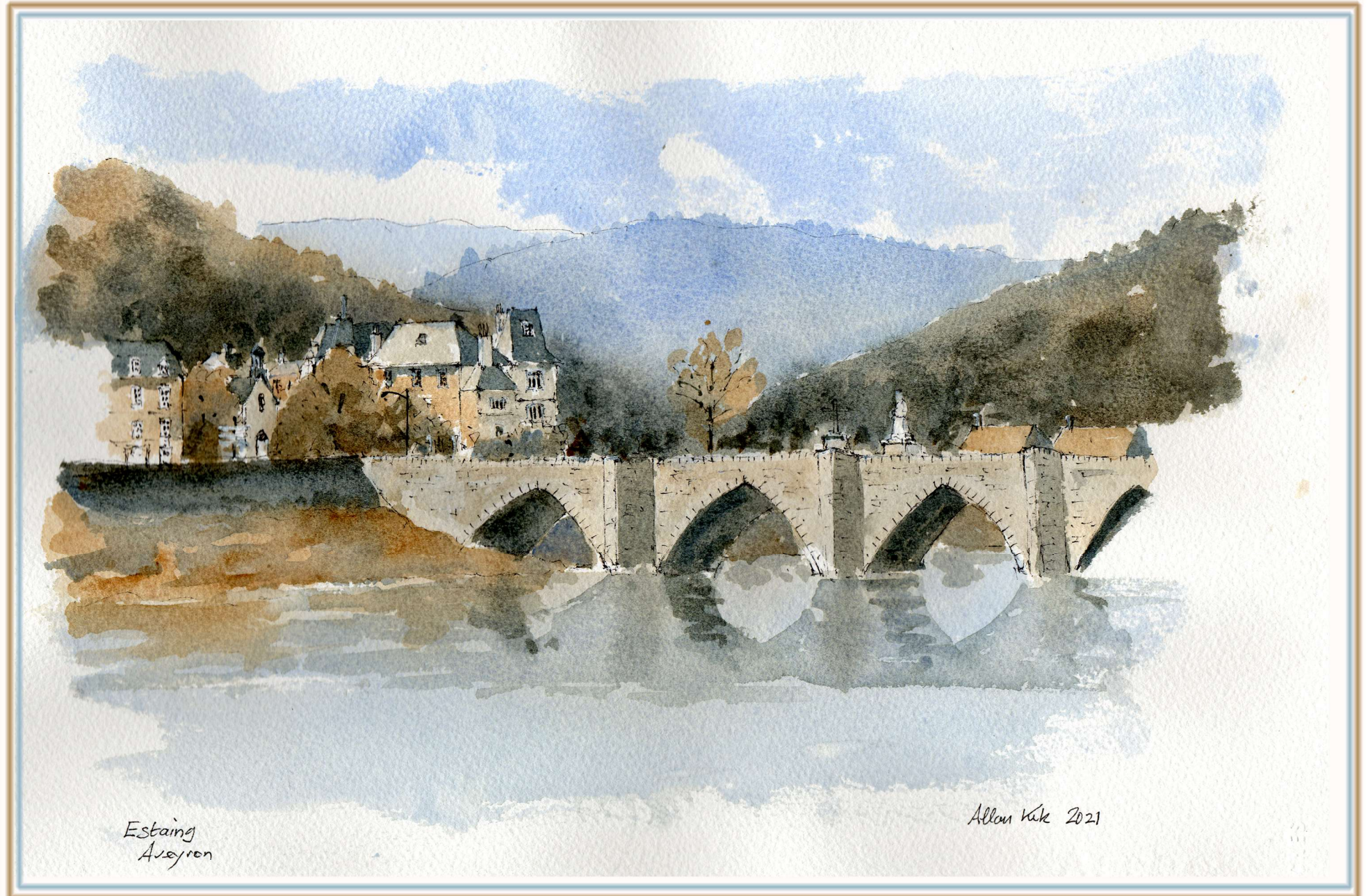
Estaing, Aveyron, France