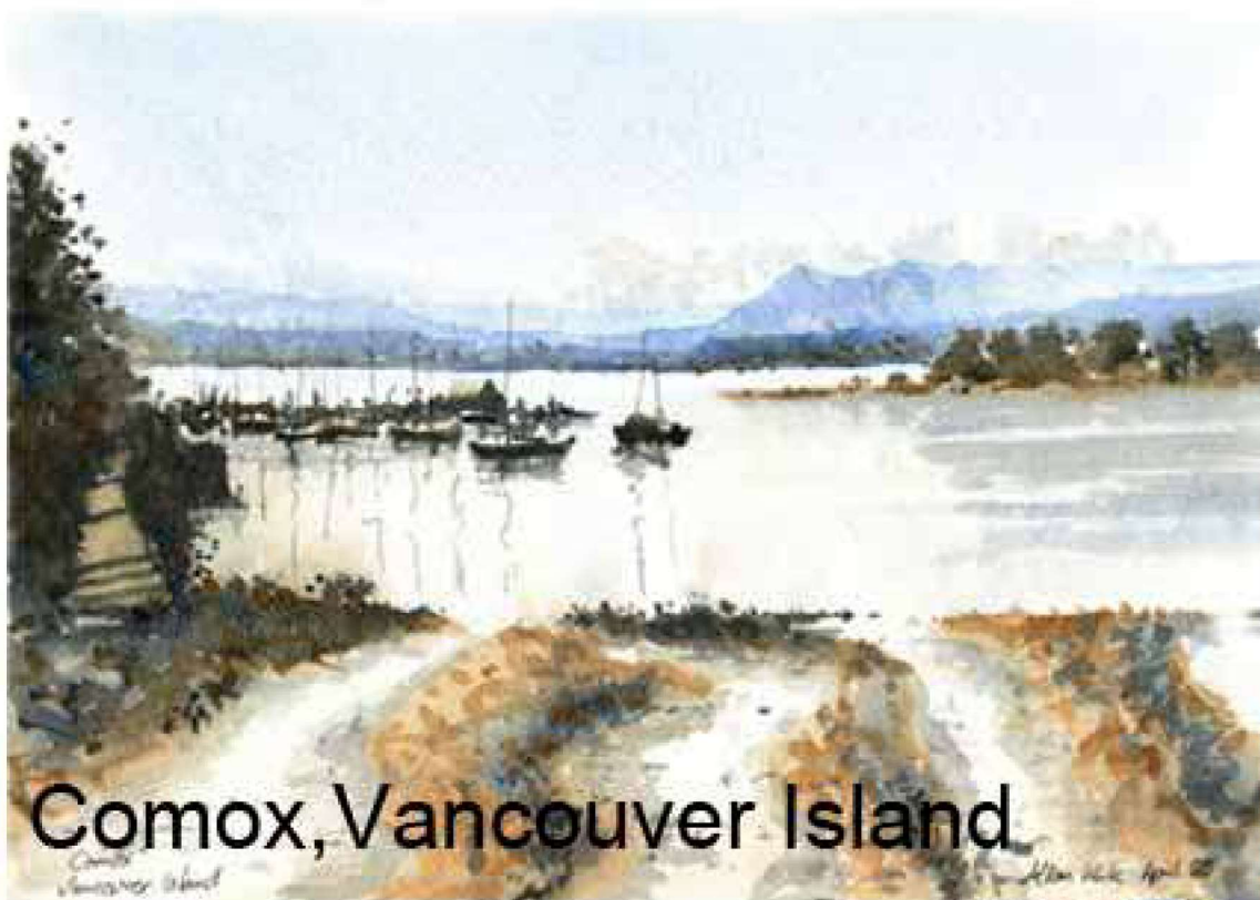
Comox, Vancouver Island