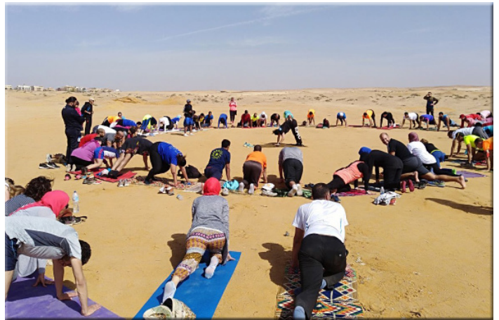
First Outdoor Yoga Session

Egypt's Protected Areas Self-Financing Project (EPASP) operates with the purpose of developing and conserving protected areas (Mahmeyat) in Egypt. Headquartered in Maadi, Cairo - EPASP aims to reduce the persisting threats to biodiversity in Egypt, and to develop a sustainable plan for reserving Egypt's terrestrial and marine habitats that are of substantial global significance