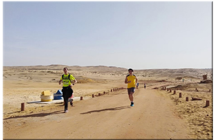
First Running Event