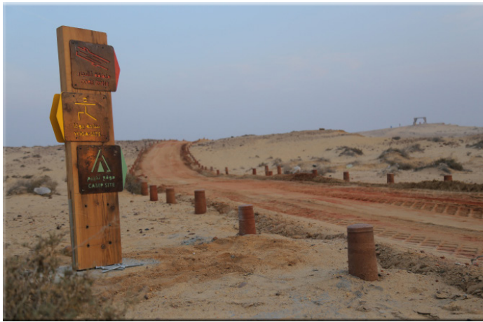
The Running Trail