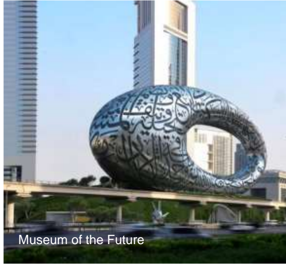
Museum of the Future