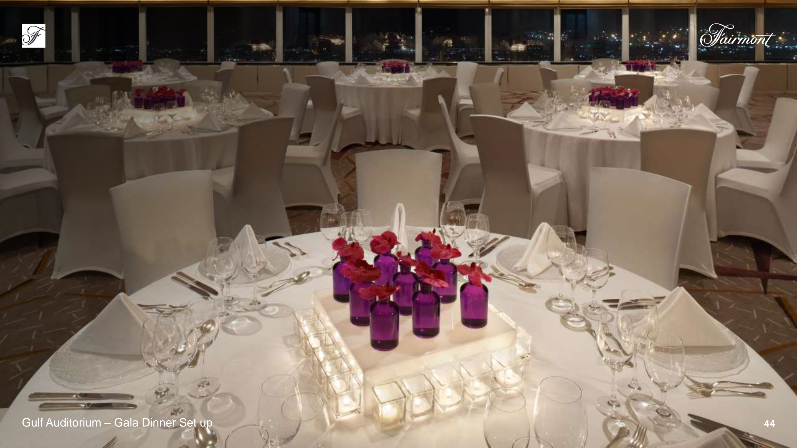
Gulf Auditorium – Gala Dinner Set up