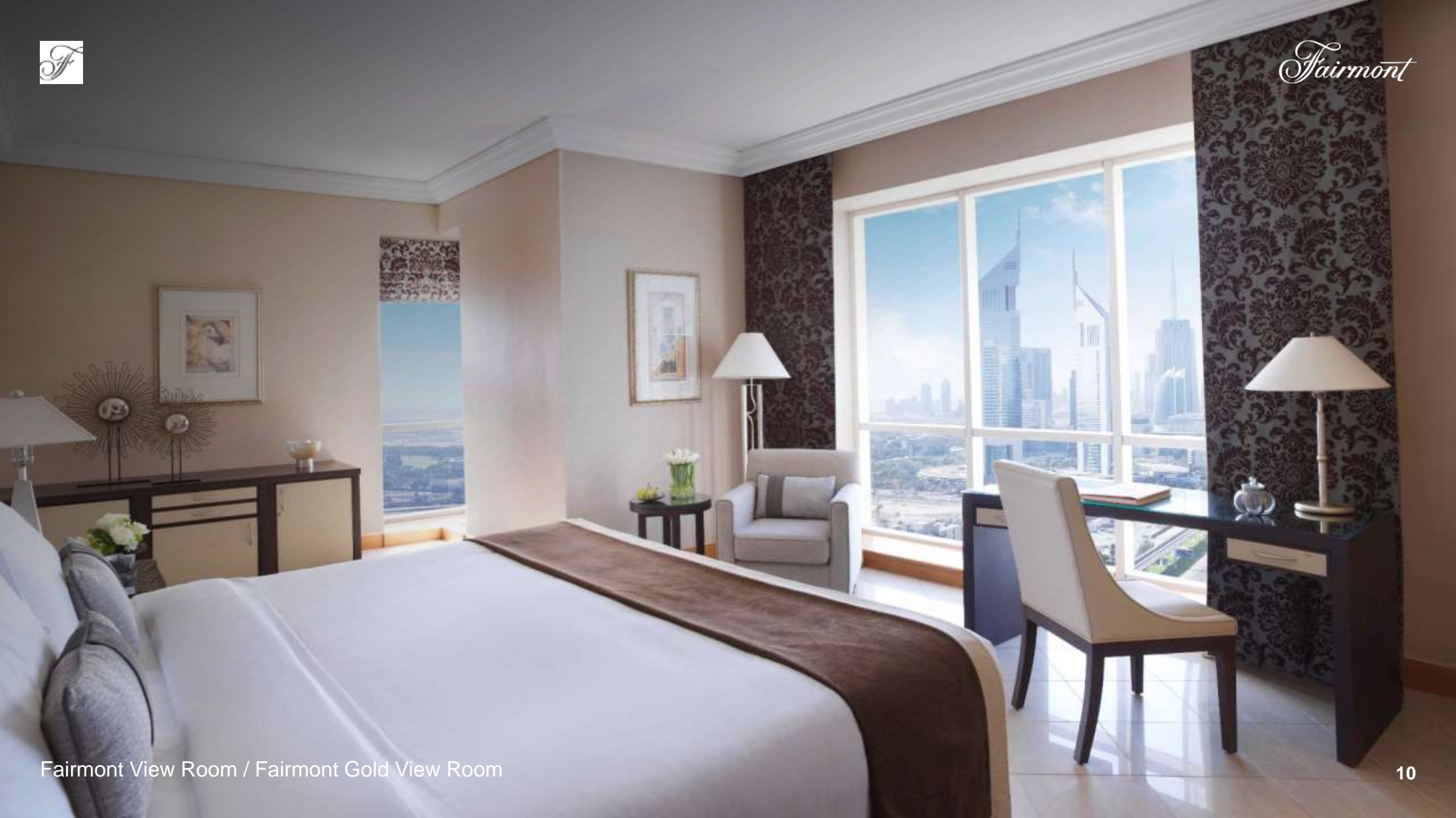
Fairmont View Room / Fairmont Gold View Room