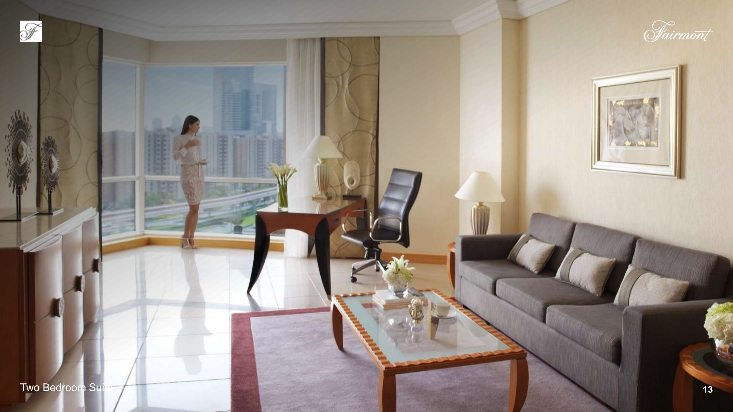
Two Bedroom Suite