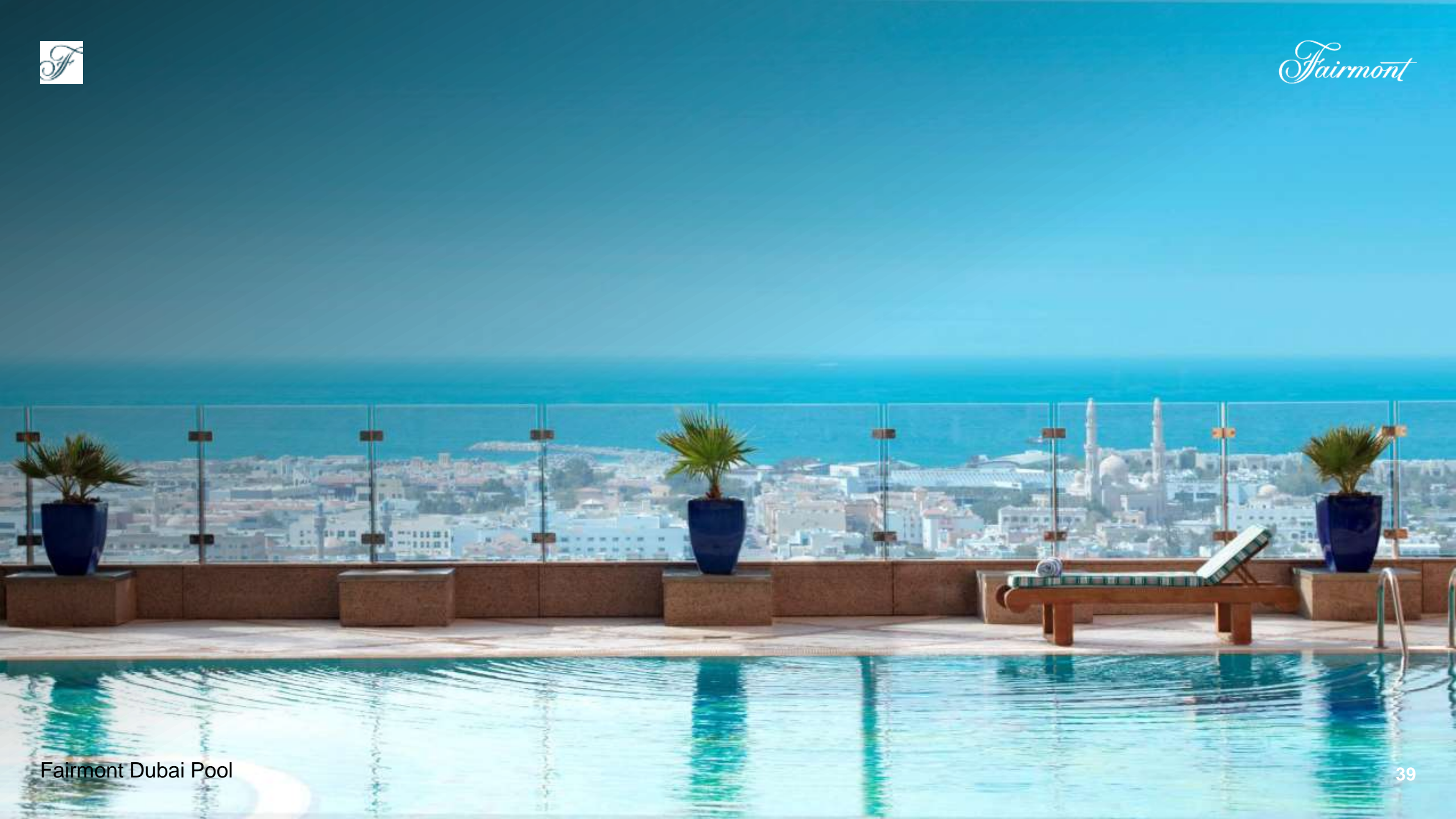
Fairmont Dubai Pool