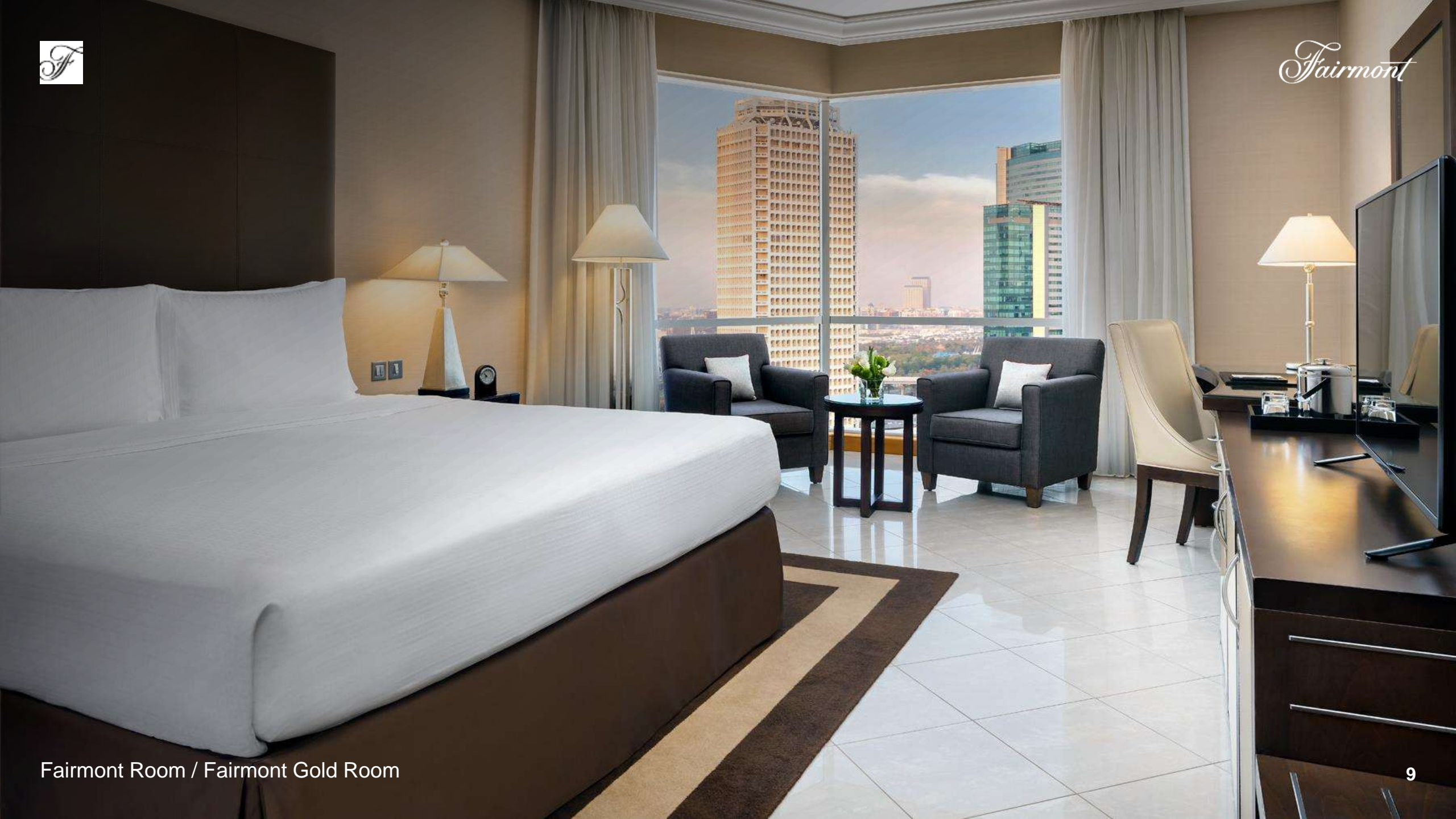
Fairmont Room / Fairmont Gold Room