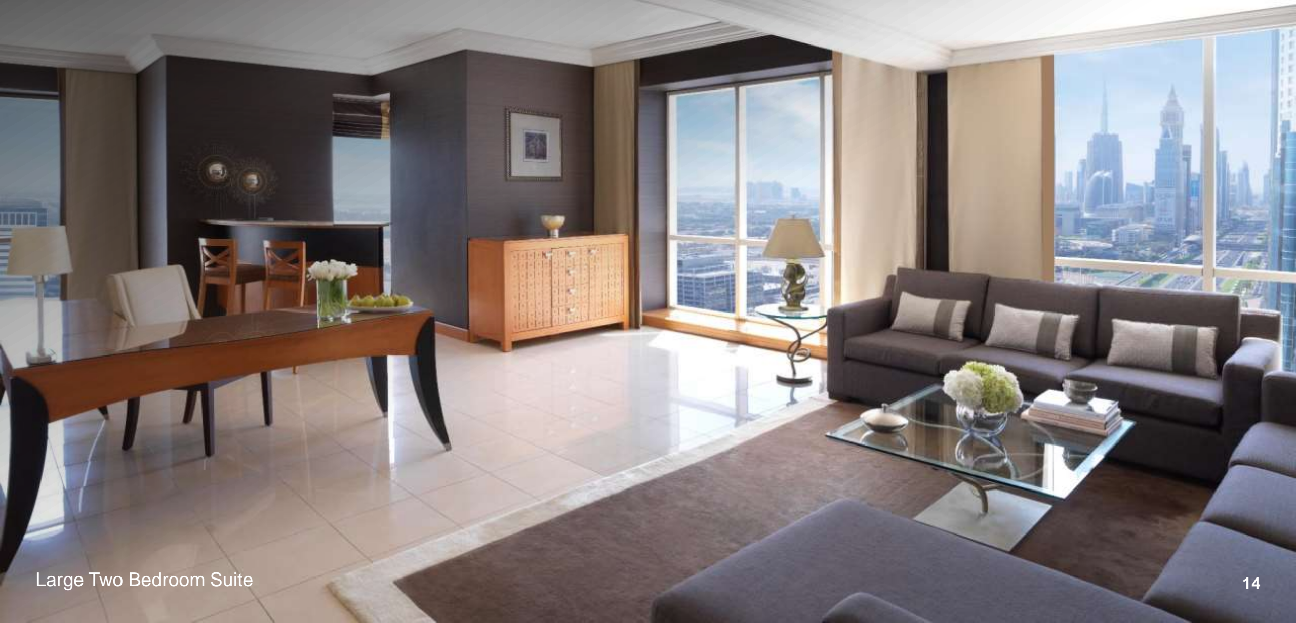
Large Two Bedroom Suite