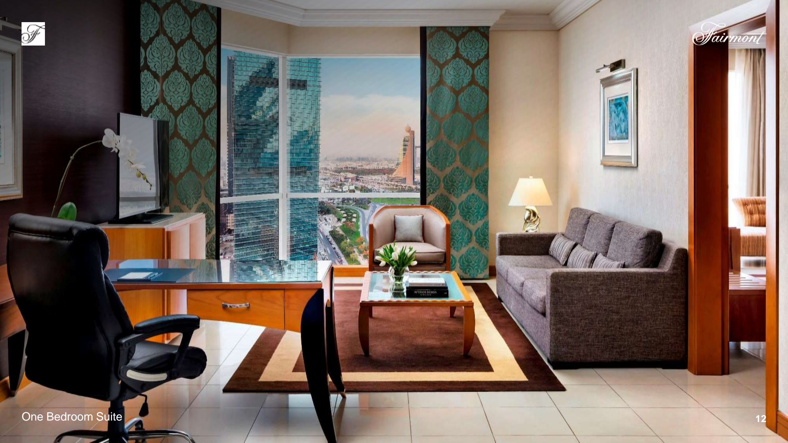
One Bedroom Suite