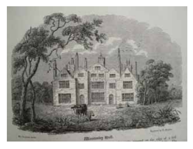
The five gabled Elizabethan front built by the London goldsmith James Bankes who bought the estate in 1595

The grounds and parkland were subject to extensive open cast coalmining in the post-war period and, subsequently, the M6 motorway was built along the edge of the parkland, clipping off one of the lodges. The grounds however have been restored after mining and the motorway is mainly in a cutting. Winstanley remains a romantic place, secluded by trees and woodland and approached by a