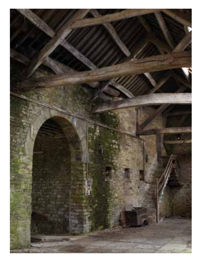
The 17th century barn is suitable as an events and exhibition space

a 17th-century barn with strutted trusses. The south stable range with central clock tower, and octagonal windows and cupolas at the corners also dates from the 1830s. The north range, with rock-faced stone, possibly dates from c . 1859. The Neptune fountain in the centre of the stable court is by William Spence and dates from c . 1830. At the east end of the yard are the central Swiss cottage and adjoining malt house with stepped gable dating from 1884 as well as a late-18th century dairy house. A number of the Lewis Wyatt gate lodges survive.