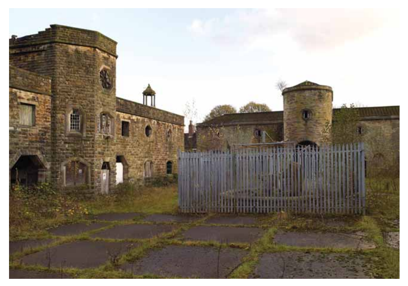
The stable courtyard built by Meyrick Bankes in the 1830s is a classic example of English eccentricity