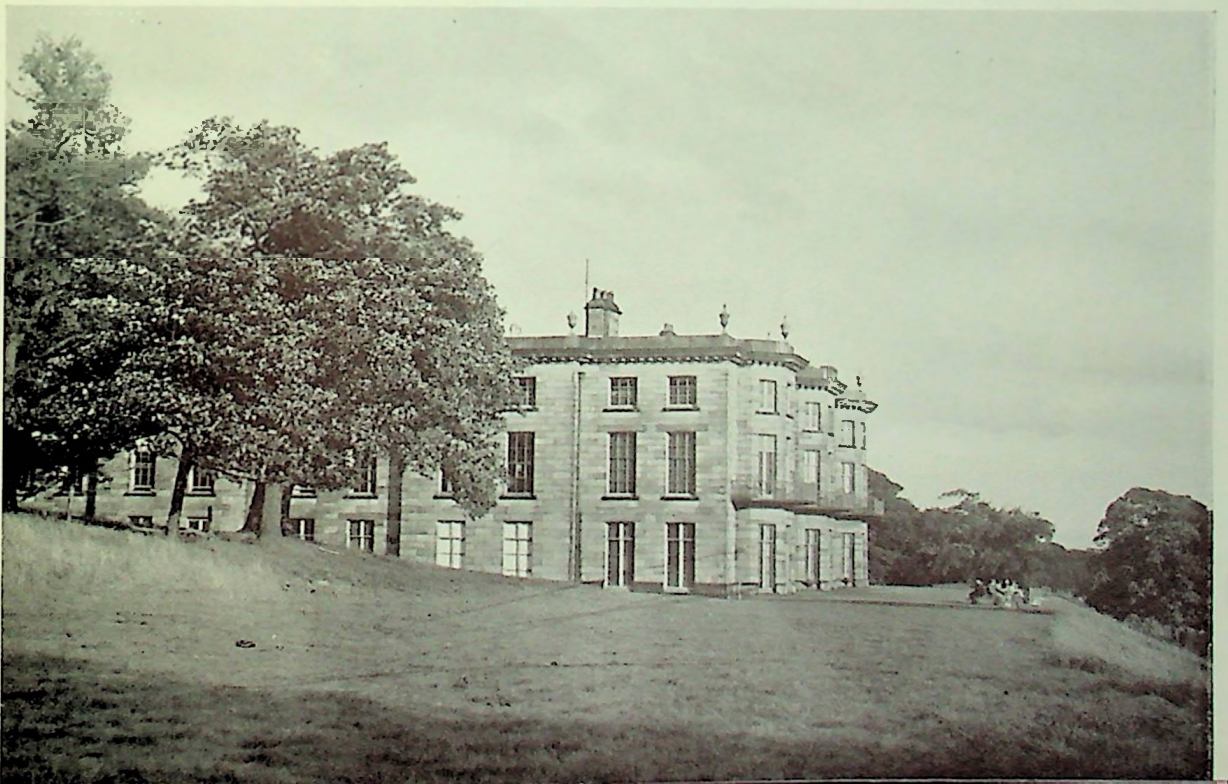
Impressive Haigh Hall