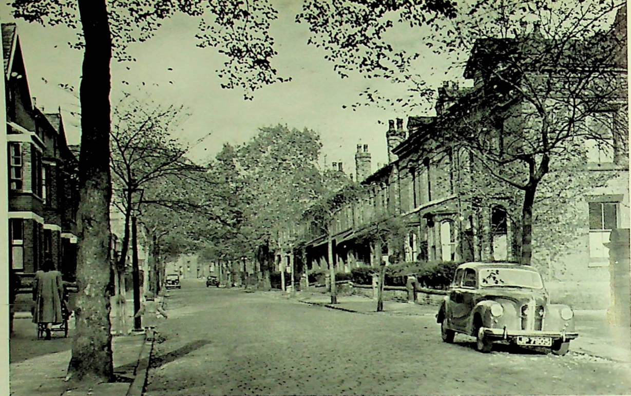
Upper Dicconson Street