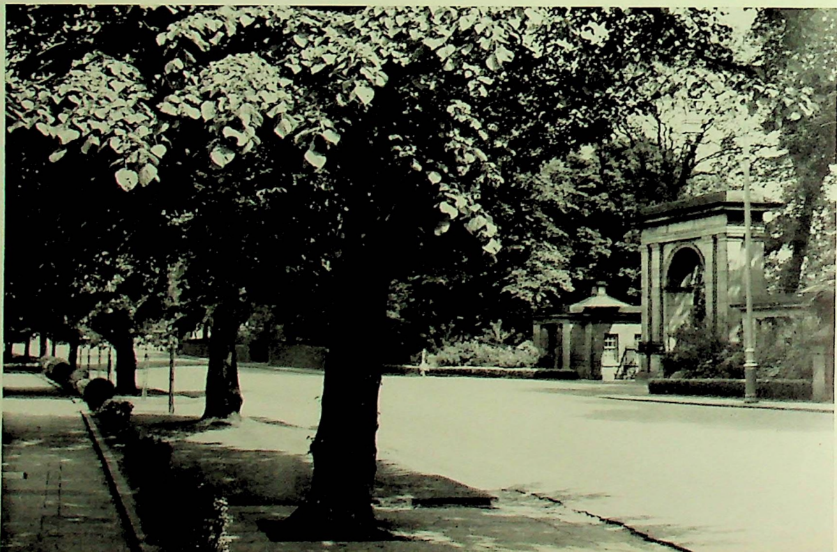
The Plantation Gates, Wigan Lane