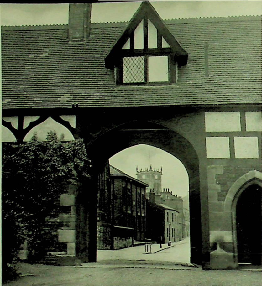
Looking up Hallgate, from the Rectory Lodge