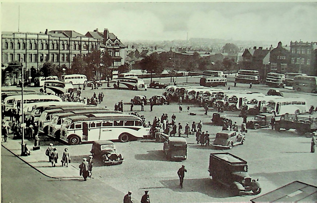
The Bus Station in Market Square