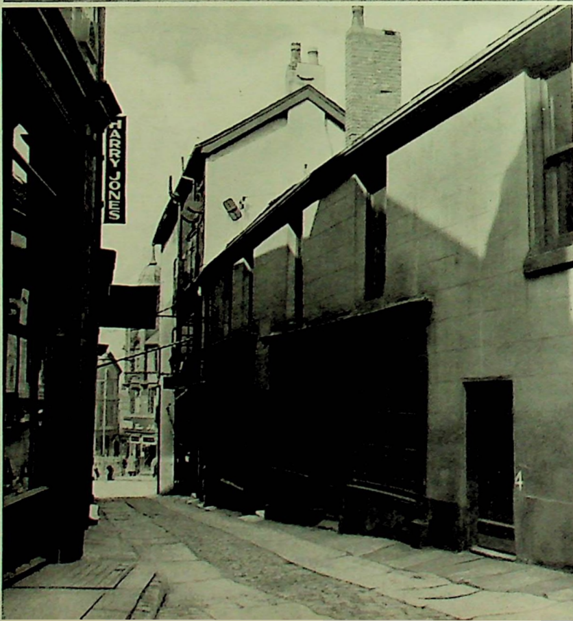
A piece of Old Wigan —the Wiend