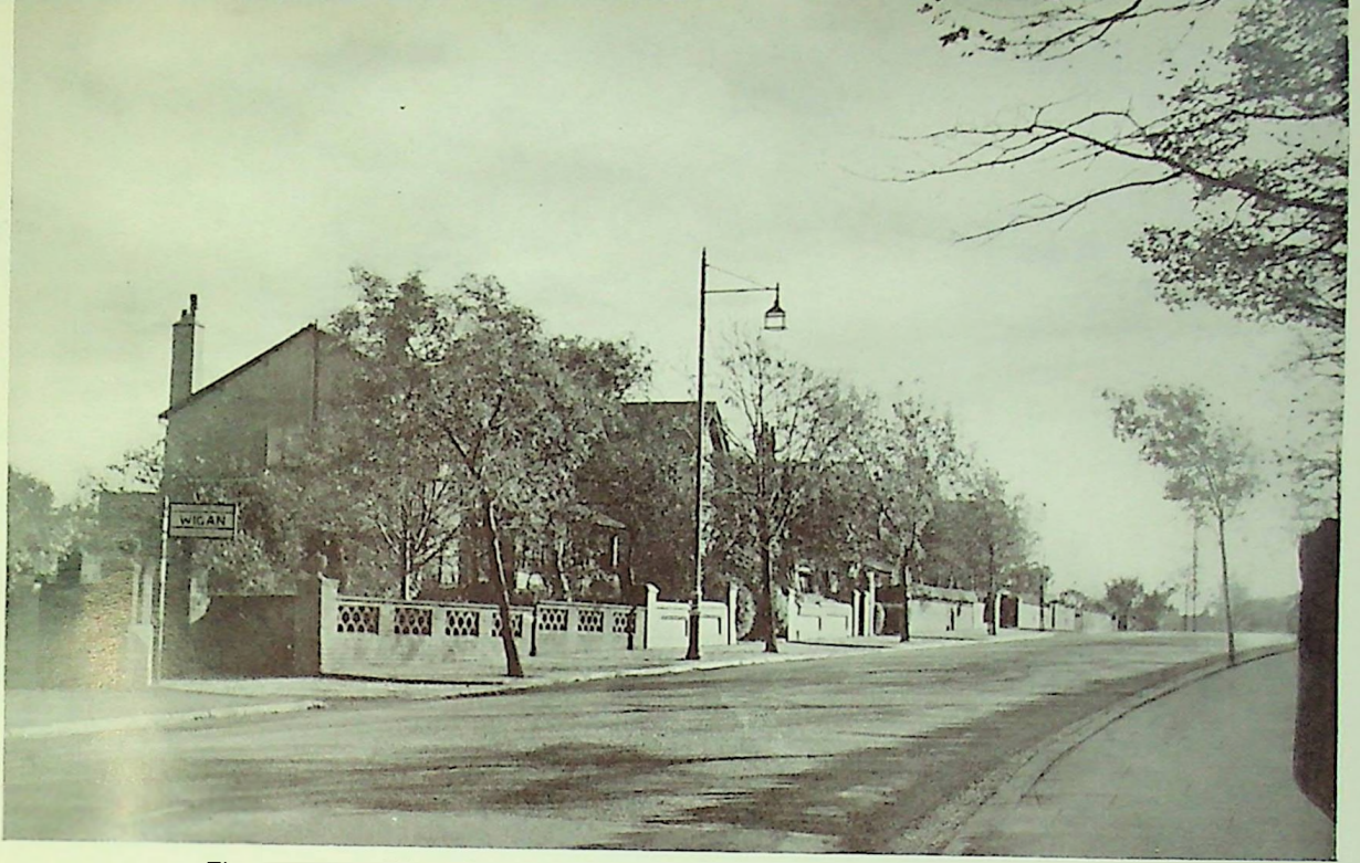
The entrance to Wigan from the north