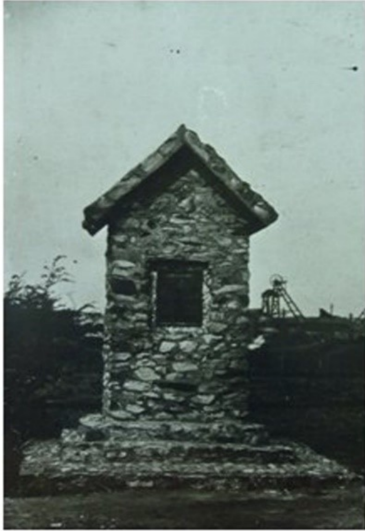
The John Pit Miners Memorial