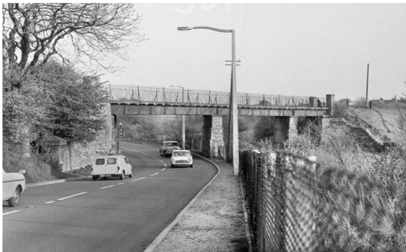
Red Bridge crossing Wigan lower road early sixties