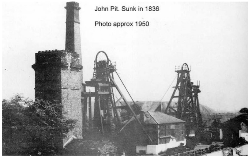
The John Pit, pit head and winding houses