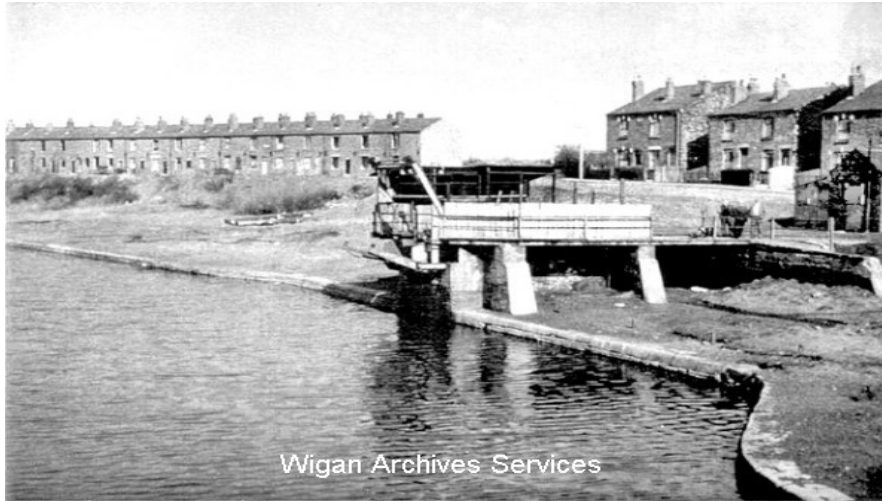
The Croke coal tipper or pier on the Leeds Liverpool canal by the Crock Hall Inn