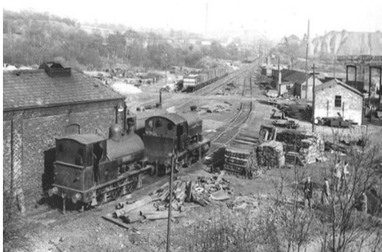
The loco's and tracks bound for the canal at Crooke via Red Bridge