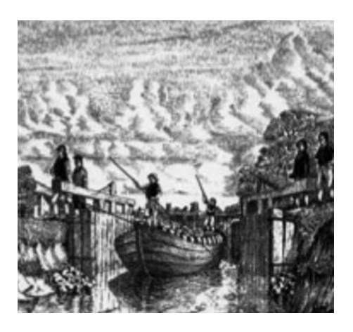
The river narrowboats at Parbold