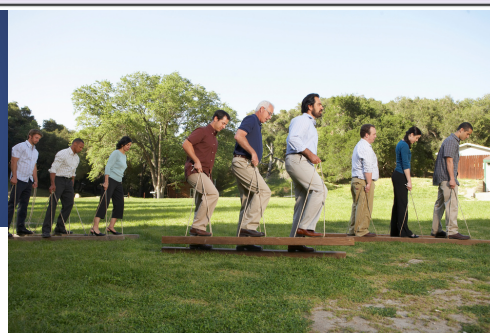
workshops in official and informal spaces