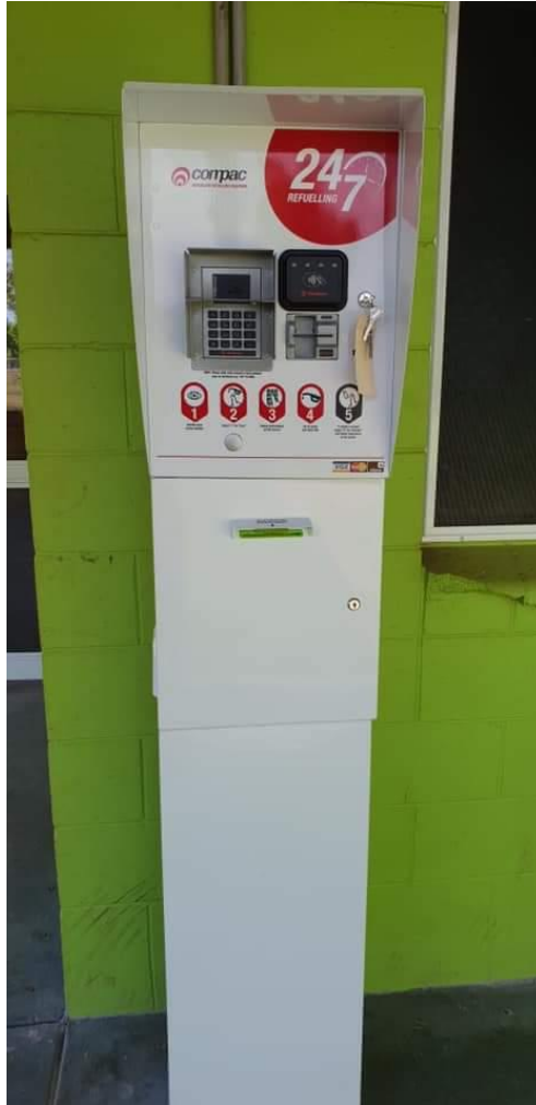
Photo of the new outdoor terminal system bringing 24/7 fuel to the Cox Peninsula

Council would like to thank the Northern Territory Government and the Federal Government for supporting funding applications that have enabled Council to operate more efficiently and contribute to the NT Government's 'Road Map to Renewables Fifty per cent by 2030' objective.