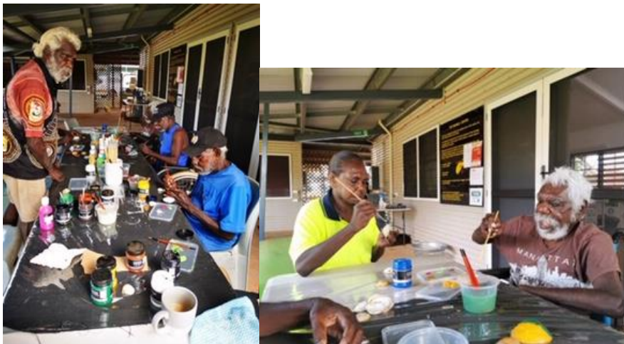
Belyuen Clients enjoying an art and craft activity and father and daughter (aged care worker) at the Centre

Council believes that the Age Care Programme and the Workshop have potential to be developed into viable enterprises that will not only bring in income to the community but will give a lot of people both aboriginal and non aboriginal people employment opportunities on the Peninsula.