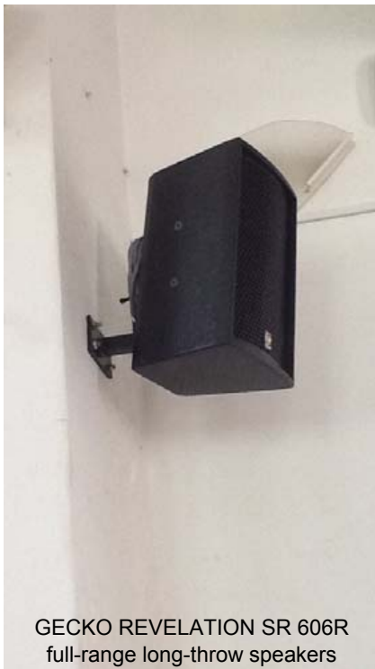
GECKO REVELATION SR 606R full-range long-throw speakers

Malaysia: The Wesley Methodist Church of Malacca has recently installed GECKO® REVELATION SR 606R 6.5" 2-Way Full Range Audiophile Long Throw Speakers as their sanctuary's FOH, and as foldbacks. This measure is taken to improve on the sanctuary's overall clarity and intelligibility as well as to achieve a more balanced and quality sound reproduction, without tweaking the sanctuary's acoustic, while keeping maintenance cost at the lowest possible. Other GECKO® products used are: GENESIS AG 550S Power Amplifier, GENESIS AG 700H C.R.I.S.T.A.L.® Class H Power Amplifier, an EXODUS MXR 3204DSP 32-Channel Mixing Console, PASSION MP 741H/RP 211U Wireless Stage Headband Microphone System, PASSION MP 311S Professional Dynamic Microphone, and AYERS ROCK DI 100P Direct Injection Box. The installation also utilised the GECKO range of TRUTH T3AL Signal Cable, TRUTH T2 Speaker Cable, and OLYMPIAN Connectors.