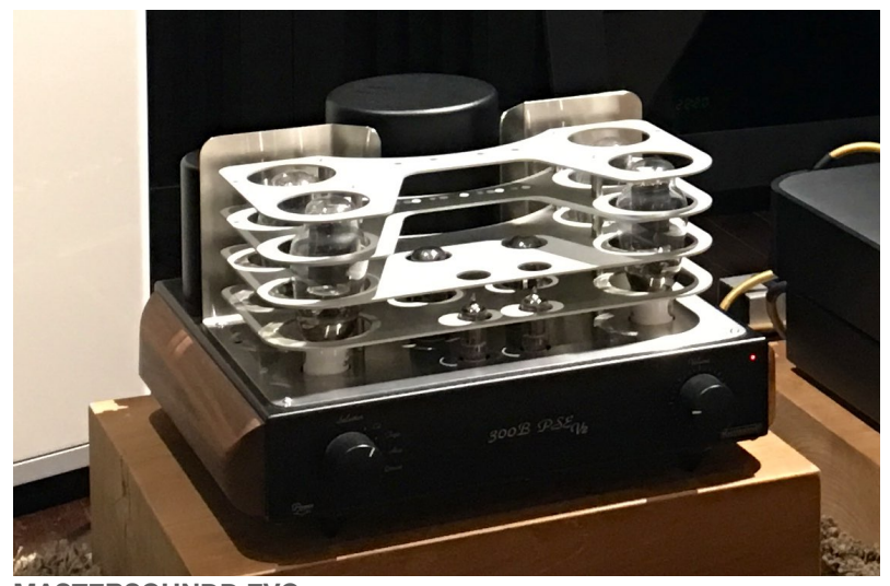
MASTERSOUNDD EVO 300B PSE V2 Class A integrated amplifier.

by those present) truly revealed that the DEFINITY M6 6.5" C.R.I.S.T.A.L.® Audiophile reference speakers triumphed over the MANGER S1 in many aspects - clarity, coverage, tonal balanced, SPL, and extension of frequency response. The MASTERSOUNDD EVO 300B PSE V2 Class A integrated amplifier was switched between tests to drive the two pairs of speakers. At the end of the sessions, the owner decided to disconnect his S1 from his system setup for good.