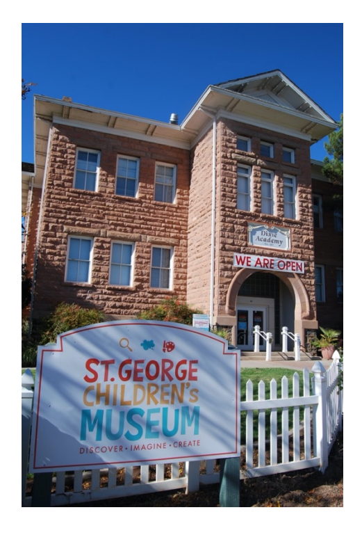
The Dixie Academy (St. George Children's Museum) 86 South Main Circa 1911

The Dixie Academy building is significant as an example of late 19th century, regional, educational Richardsonian Romanesque architecture. The building expresses the early citizens' commitment to the value of higher education. In the early 1900s, St. George offered students only two years of high school education. After Apostle Francis M. Lyman encouraged establishing a local church school to meet the needs for a higher education institution, construction on the building began in 1909. With a $20,000 donation from The Church of Jesus Christ of Latter-day Saints, and $35,000 in labor and materials donated by the community, the construction was finished in 1911. Even though the windows were not set and the interior not completed until 1913, the St. George Stake Academy moved in and instruction began. The upper floor was used as a gymnasium until 1916, when the new Dixie Academy Gymnasium building was constructed next door on what is the current location of the Town Square. This Dixie Academy building served as a home for the St. George Academy, the Dixie Stake Academy, Dixie College, Dixie Junior College,