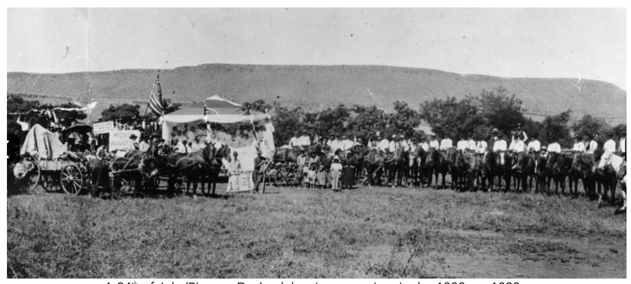
A 24th of July (Pioneer Day) celebration sometime in the 1880s or 1890s.

Town Square, located inside the downtown historic district, was the site of the Old Bowery, where the early settlers held church and conferences until the completion of the Tabernacle in the 1880s. The scene of patriotic Fourth of July celebrations, today the square is surrounded by some of the city's most prominent historic buildings. The park features several dramatic water features, shade pavilions, a carousel, artwork, and a monument tower.