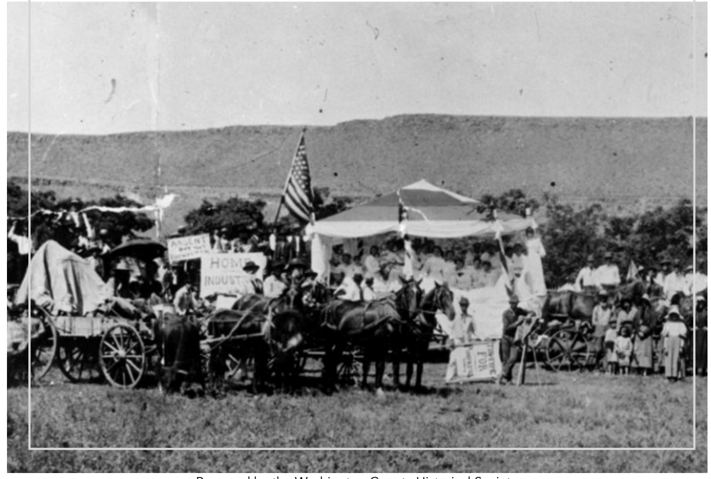
Prepared by the Washington County Historical Society