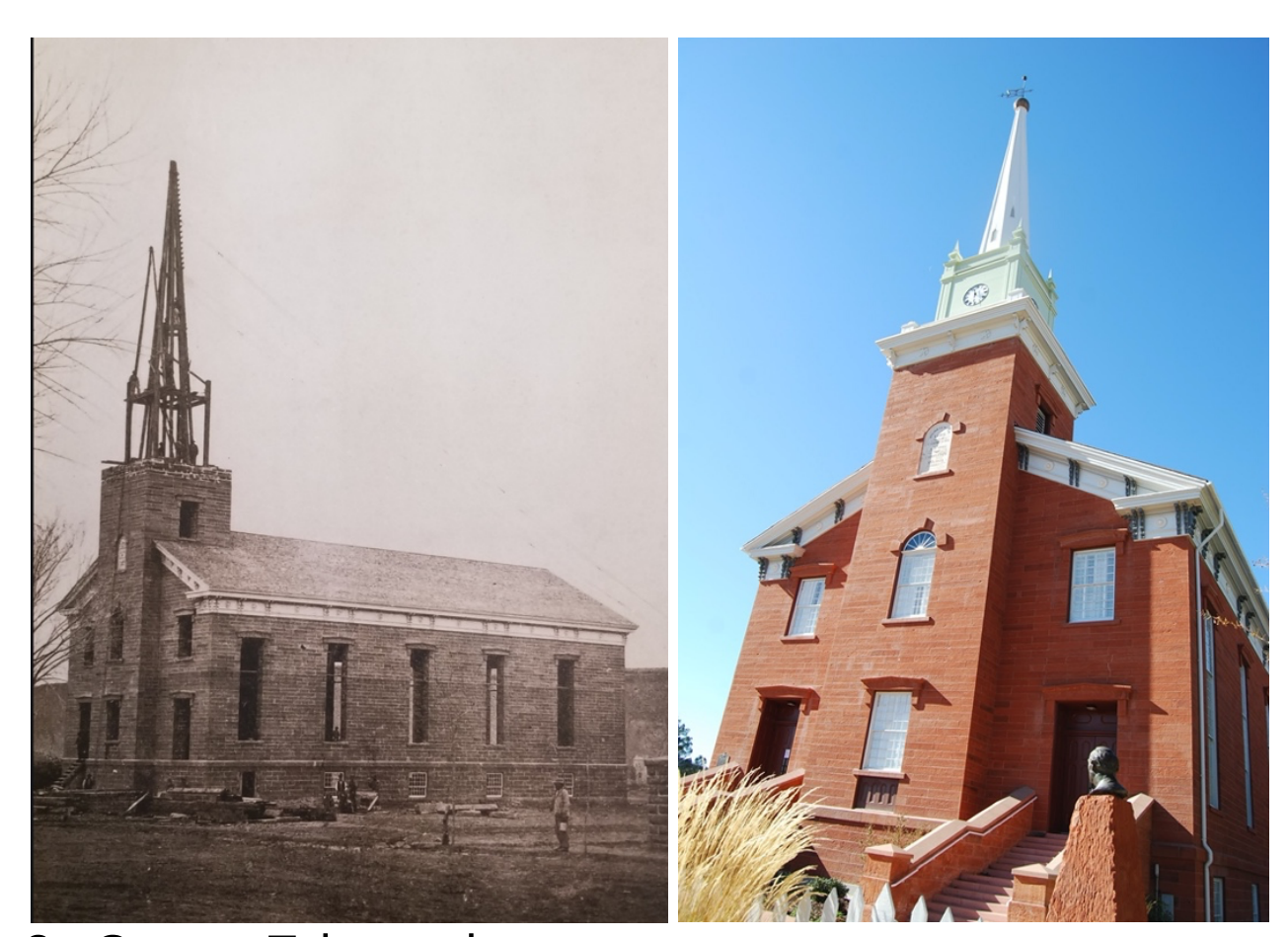
St. George Tabernacle 18 South Main Circa 1876

by the villagers. The blocks in the historic heart of St. George are 528 feet square, with an area of 6.4 acres, and major streets are 90 feet wide. Each block was originally divided into eight lots. In addition to a house, each town lot contained gardens and orchards for food production, and pastures, pens, and corrals for domestic animals, along with outbuildings such as barns and granaries.