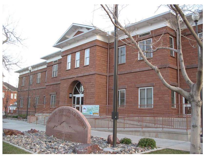
Washington County School District Office