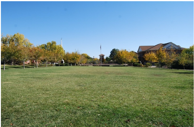
Town Square 50 South Main Circa 1861

Town Square, located inside the downtown historic district, was the site of the Old Bowery, where the early settlers held church and conferences until the completion of the Tabernacle in the 1880s. The scene of patriotic Fourth of July celebrations, today the square is surrounded by some of the city's most prominent historic buildings. The park features several dramatic water features, shade pavilions, a carousel, artwork, and a monument tower.