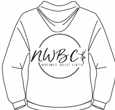
BACK (LOGO 2)