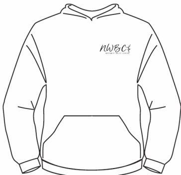
FRONT (LOGO 1)