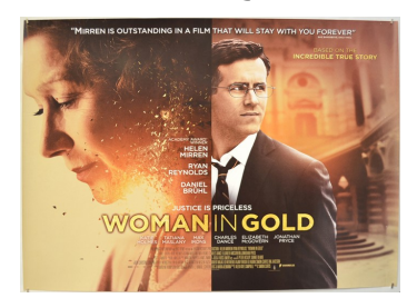
Woman in Gold (2015)