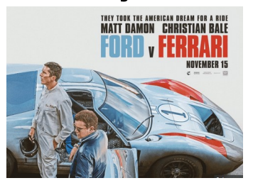
Ford v Ferrari (2019)