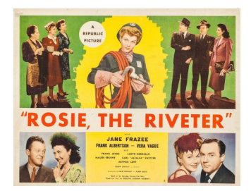
Rosie the Riveter (1944)