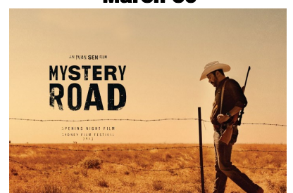
Mystery Road (2013)