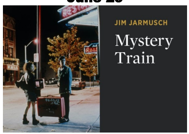
Mystery Train (1989)