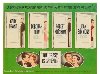
The Grass Is Greener (1960)