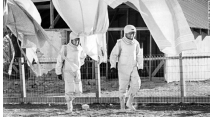
Andromeda Strain - 1971

Amid fears stoked by the coronavirus, "Contagion" -- a 2011 movie about a pandemic with potentially eerie similarities to recent events -- has been climbing up the iTunes rental charts, reflecting how people often use fiction as a means to process reality.