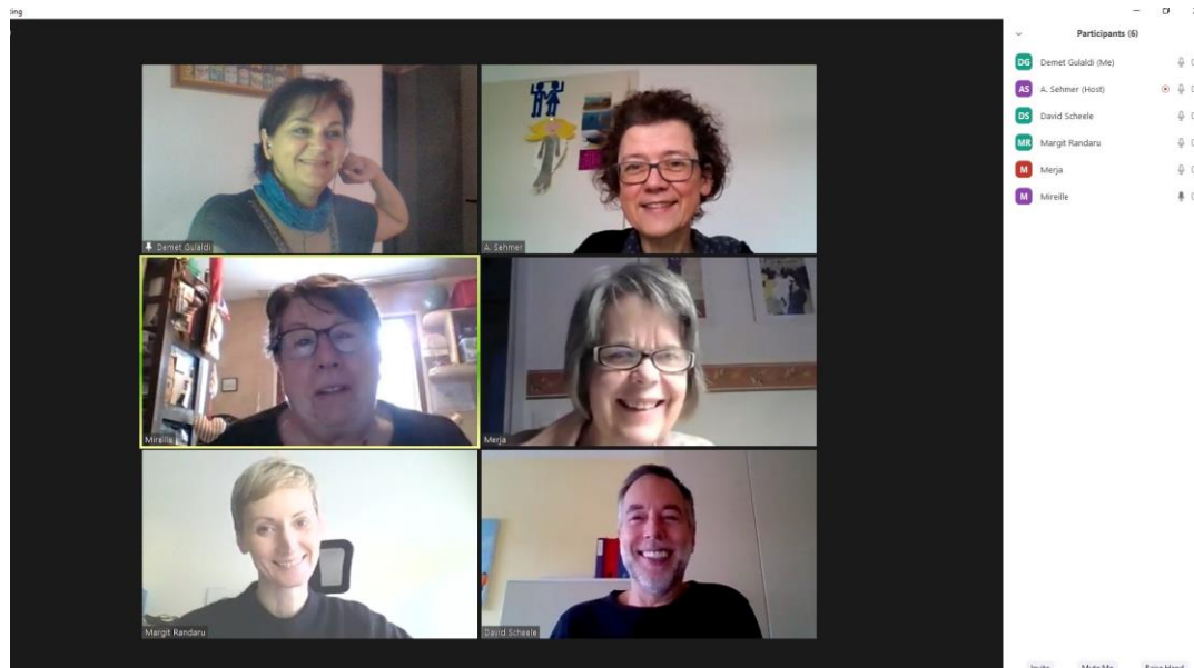
EC at work in their own place but all together

The Executive Committee came together online twice in 2020. The first meeting was held on 30th May 2020. The second meeting took place on 25th October. In May 2020, the EC organized one day BD meeting for only reviewing Financial report 2019.