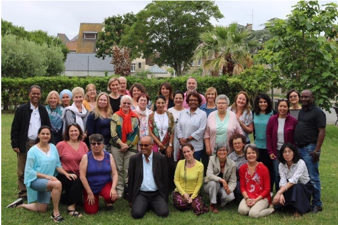
Participants BD meeting 2019 St. Malo, France