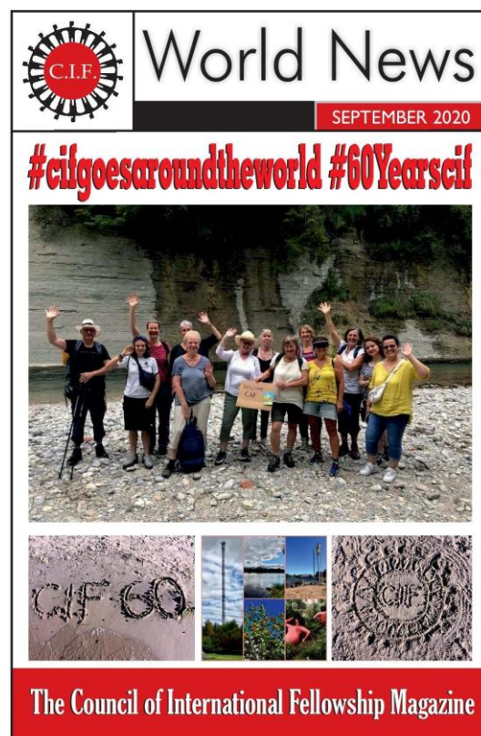
Cover WN Summer 2020

The World News is a magazine produced twice a year (Summer and Winter) with the purpose of informing, exchanging ideas and networking for CIF members and the general public. Included are all of the "happenings", updates of the organization, including information on events, issues, accomplishments, projects, exchange programs and much more.