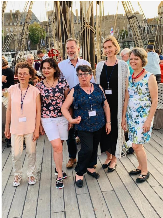
Executive Committee 2019-2021

This is the eighth Annual Report of the Council of International Fellowship (CIF). The Executive Committee of CIF International, together with the Board of Directors and CIF members, has looked back at the objectives set in 2020 and the progress we have made. The mission from the Statutes is our guideline to set objectives and translate these into actions. This document is updated every year, considering progress, discussions and input from various committees and meetings. During the next Board Meeting which will be held online in August 2021, we will give an update on our progress.