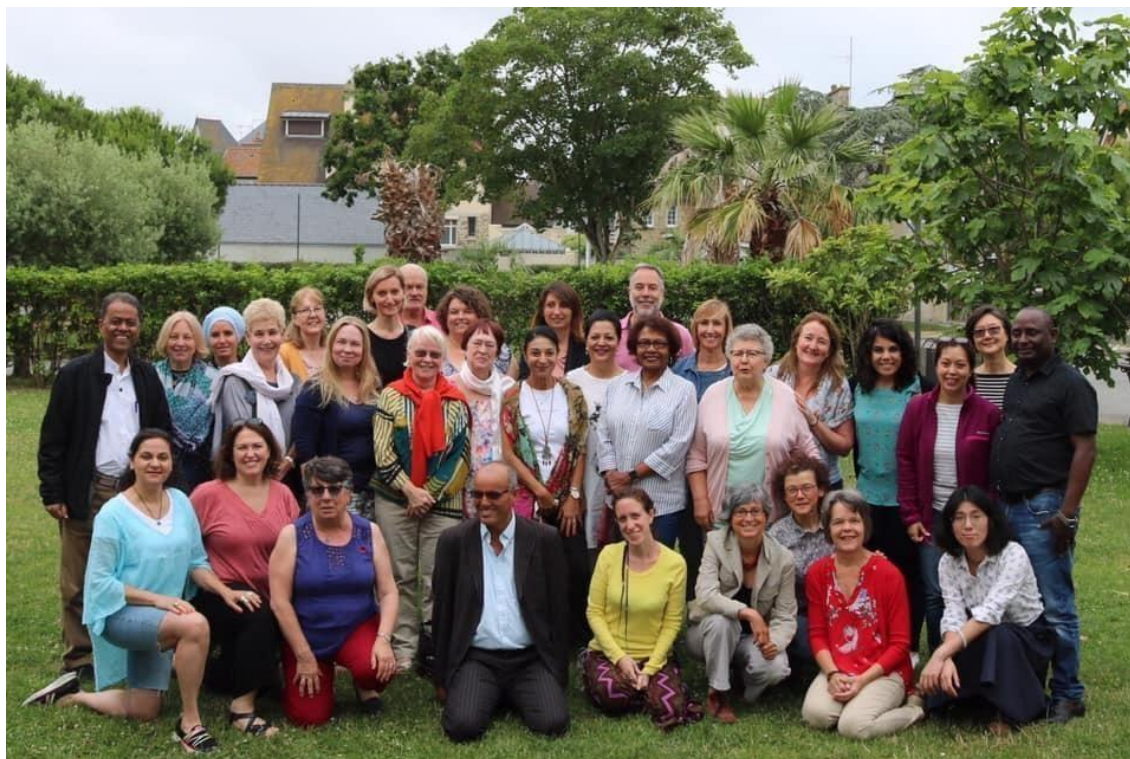
Participants BD meeting 2019 St. Malo, France