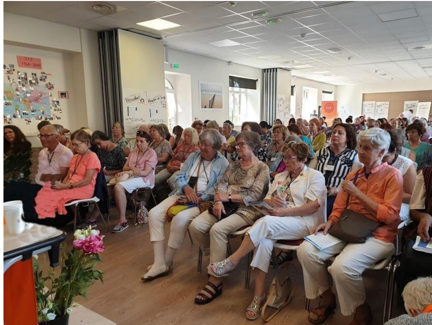
General Assembly 2019

The general Assembly is held once in two years. The last one was in 2019.