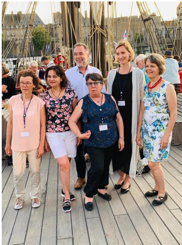
Executive Committee 2019-2021

The mission from the Statutes is our guideline to set objectives and translate these into actions. This document is updated every year, considering progress, discussions and input from various committees and meetings. During the next Board Meeting which will be held online in August 2021, we will give an update on our progress.