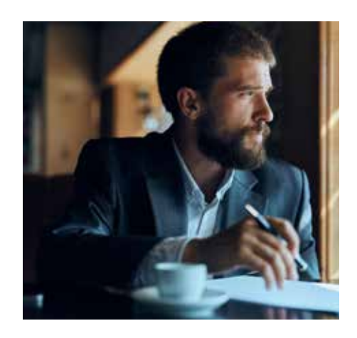
12 WEALTH CREATION

Where can you turn if you want to invest tax-efficiently?