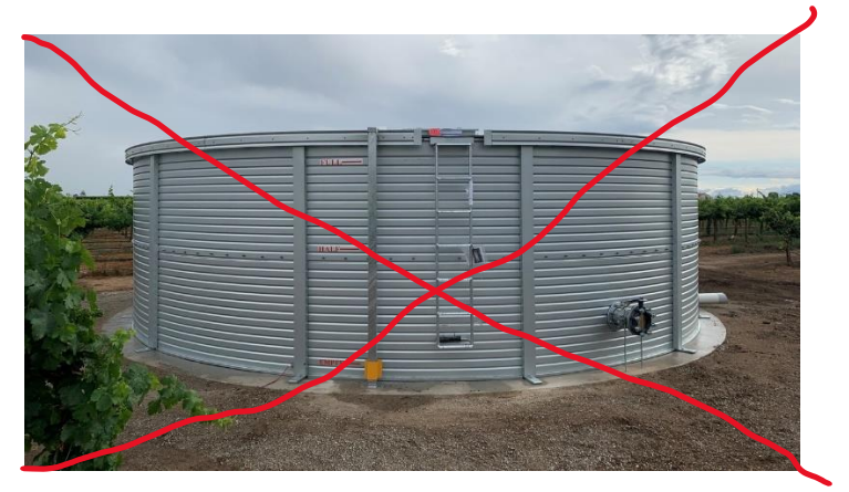
First consideration (20,000 gallons). After severe snow storm, determined flat top would not bear snow load.