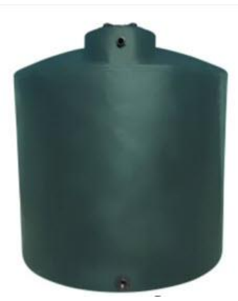
Conical shape preferred (10,000 gallons).