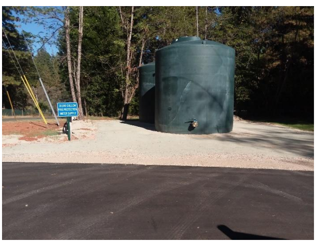
After clearing with water tanks installed