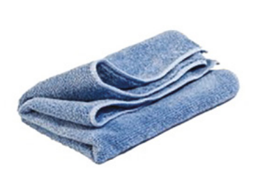
Micro-Fibre Eraser Cloth