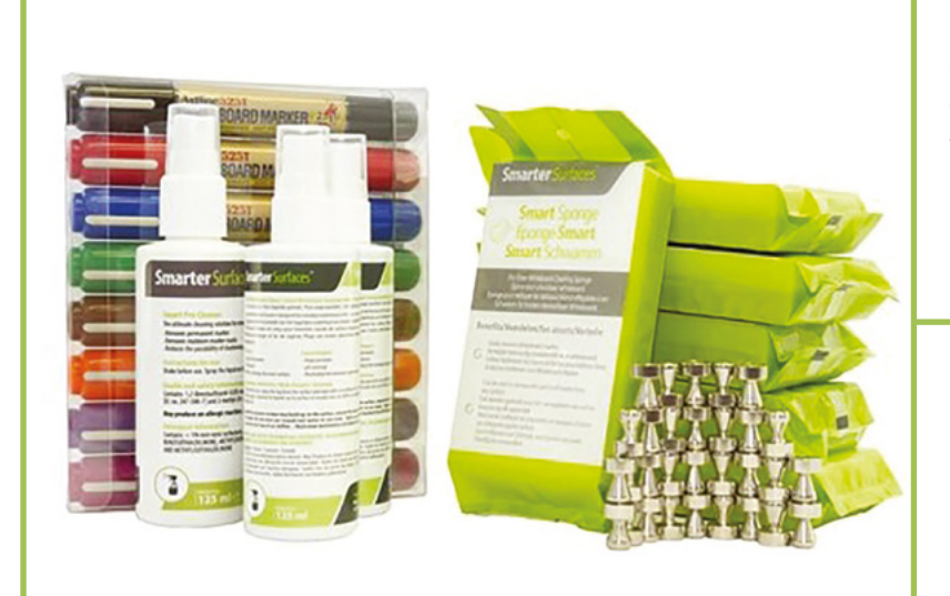
Magnetic Whiteboard User Kit