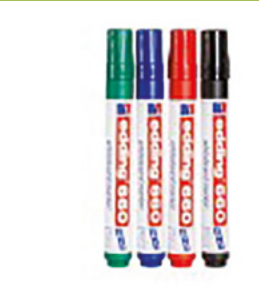
Whiteboard Markers - 4 pack