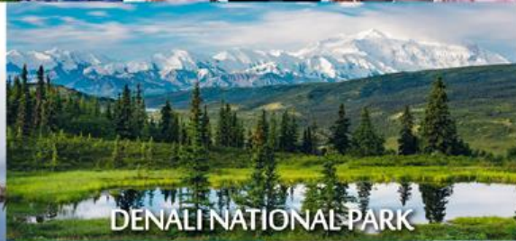
DENALI NATIONAL PARK