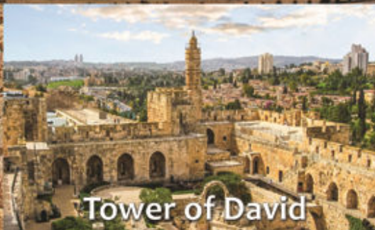
Tower of David