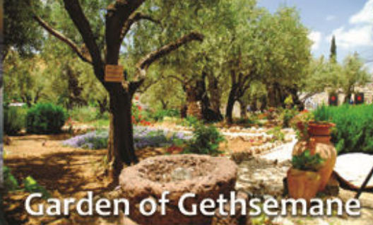
Garden of Gethsemane