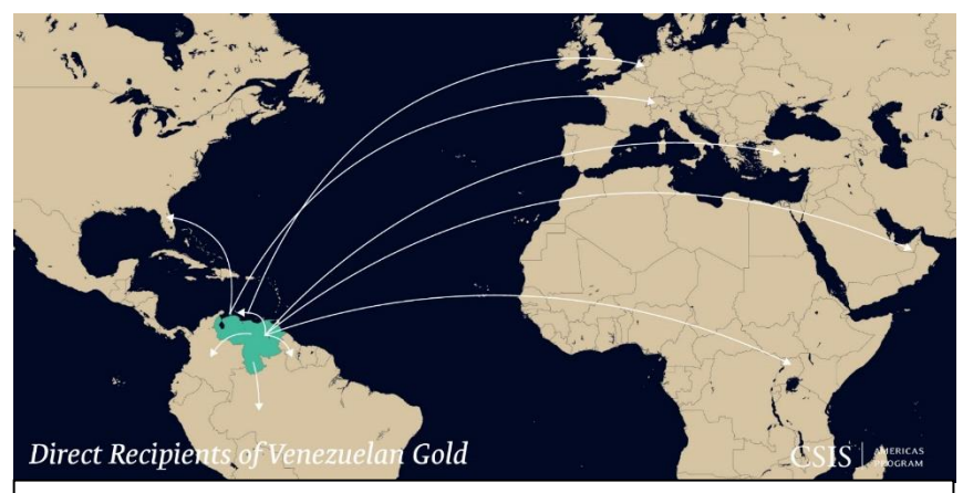
Most of the gold is fraudulently legalized after being smuggled into Colombia, Brazil, and Guyana, among other countries. Venezuelan blood gold ends up in the Middle East, Europe, Africa, and the United States. Source: CSIS, 16 April 2020. [4]

The gold mining in Venezuela either takes place on rafts on the river where hoses are used to destroy the embankments of the rivers and clear waters are being transformed into muddy pools full of the toxic mercury, or river terraces are transformed into mud pools to wash the gold. The drivers of the illegal mining criminal miners, are protected by Colombian guerrilla [4] and partly by the Venezuelan military and police itself, and smugglers