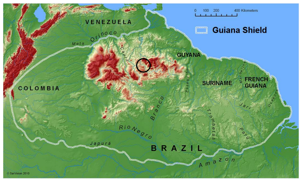
Map of Guiana Shield © SarVision. [2]. The Canaima Park is in the area shown in the centre near the border with Guyana.

The VALUE: The value of the selected AOI is that Venezuela is a mega biodiversity country and an important part of the Amazonian region, which plays a crucial role in regulating the global climate. As with biodiversity in Colombia, Brazil, and the whole of the Guiana Shield, Venezuela is home of unique species of fauna and flora. One of the areas, which is of great importance to the whole world is the Canaima National Park - a World Heritage site - spread over 3 million ha in south-eastern Venezuela reaching the borders with Guyana and Brazil. In addition this area is the home of several indigenous people, residing in and protecting this heritage.