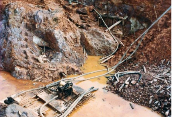
Cutting pump in Venezuela