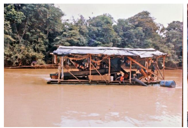
Raft on Cuyuni River, Venezuela