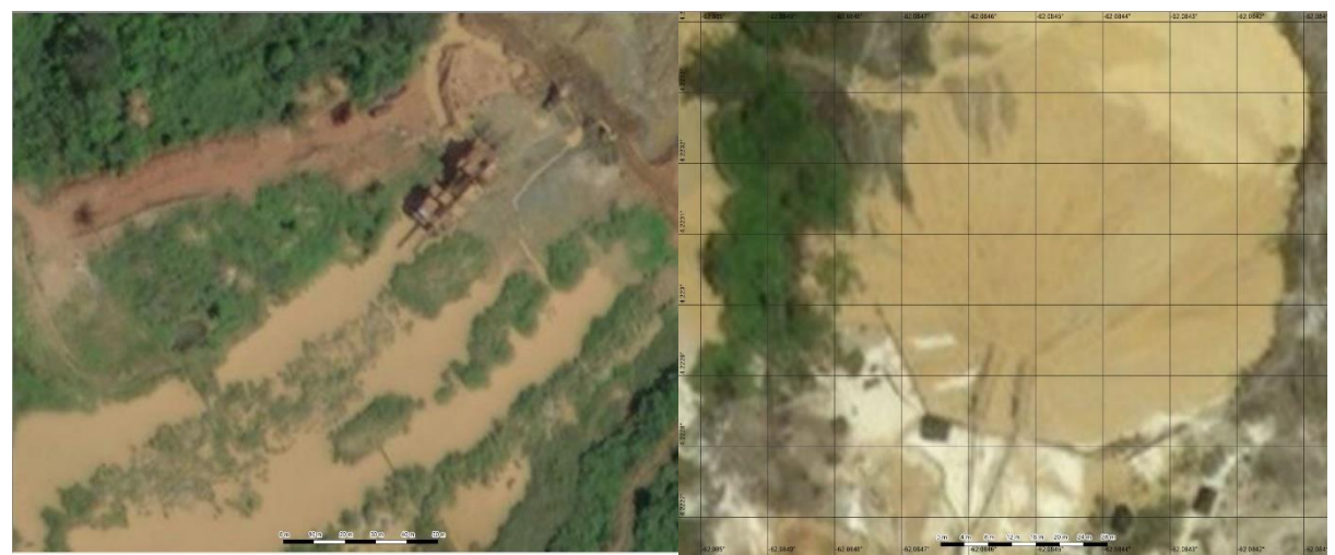
VHR image of sluice in similar AOI in Nigeria