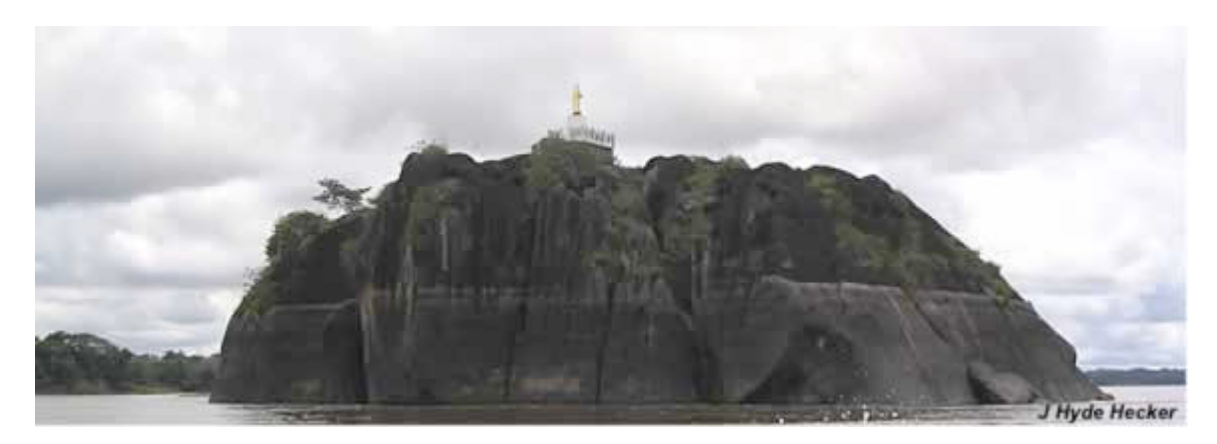
Figure 4. One of the many outcrops of the Guiana Shield in the Orinoco River

Using the work carried out in phase one of GSI on the contribution of indigenous management to conservation and sustainable use, as well as previous projects funded by the NC-IUCN and the EU, the GSI could use Matavén Forest as a pilot in which indigenous management of ecosystems providing goods and services would be assessed.