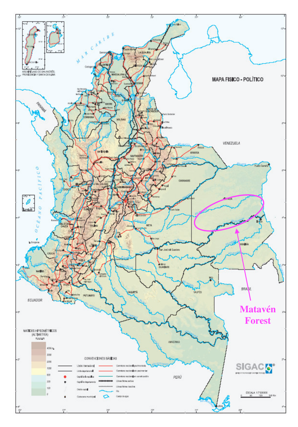
Figure 1. Map of Colombia highlighting the Matavén Forest