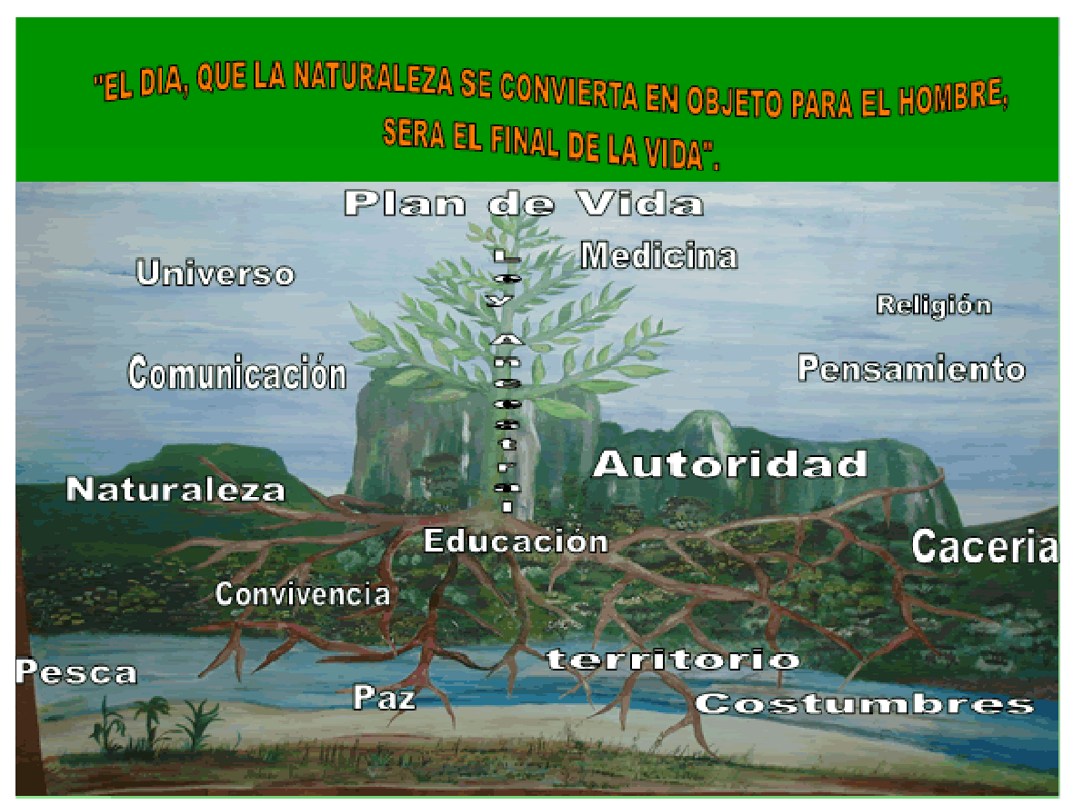
Figure 3. Representation of the patrimonial belief system of the indigenous people of Matavén.

be the end of life". The allegory of their life plan is a tree where part of the root of the tree is nature, the trunk – the ancestral laws and the branches – knowledge, religion, communication etc. (Figure 3).