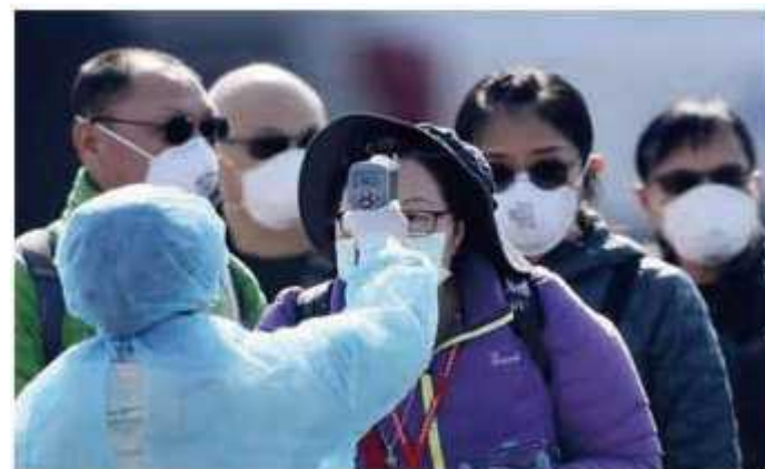
High Volume of Management