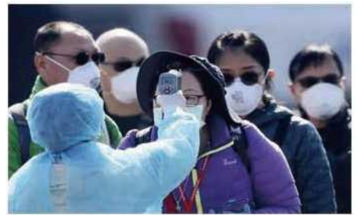
High Volume of Management