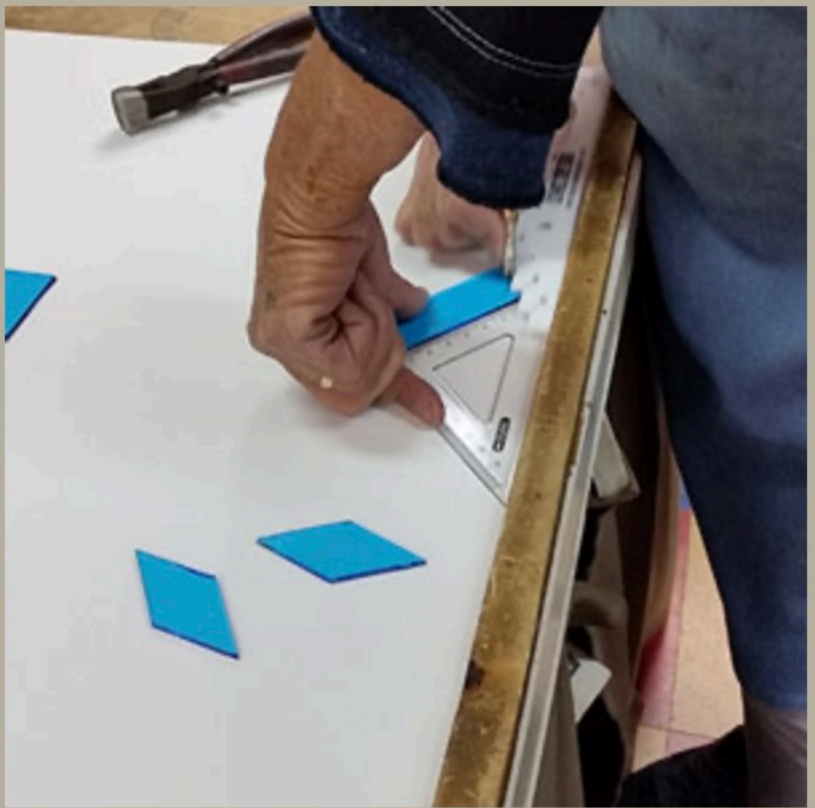
You can easily make a either a 6 or 8 piece star.