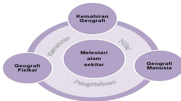
Figure 1: Focus of the Upper Secondary Geography Curriculum

Geography is one of the subjects offered in the education system in Malaysia and was first introduced at the primary level since 1927 and at the university level in 1959. Previously, geography was a core subject for the lower middle and upper classes. However, following the introduction of the New Secondary Curriculum (KBSM) in 1989, geography subjects have been changed from core to elective (Ministry of Education Malaysia, 2015). This has led to a decline in the number of students studying geography. At the same time, there are also students who feel that this subject is not important (Mohmadisa et al., 2013; Abdul Hamid et al., 2006). In fact, one of the reasons schools do not offer geography subjects at SPM level is also because students' excellent achievement in geography subjects is low in SPM examinations (Shamsiah & Azman, 2015). Thus, there is a concern that the geography of the subject will continue to be considered as the subject of choice if the student does not show good performance in the examination.