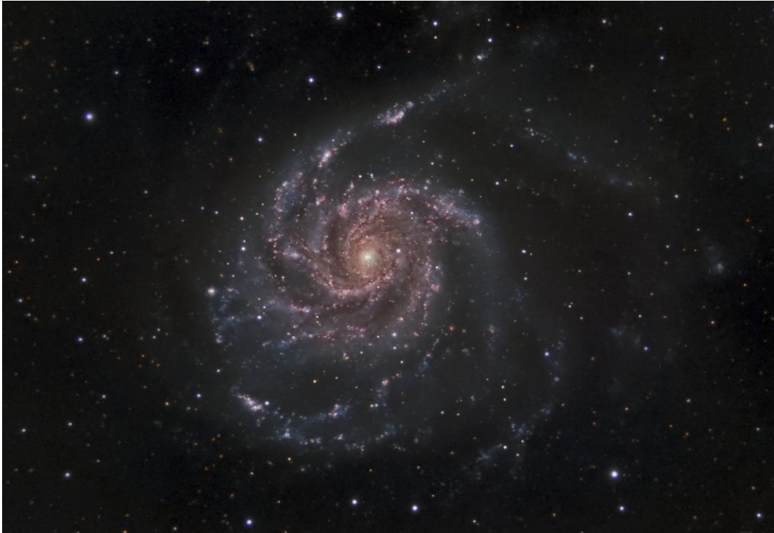
A very nice Pinwheel Galaxy (M101)