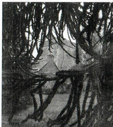
Pictured: Kilravock Castle viewed through the branches of a Monkey Puzzle Tree in Kilravock Gardens