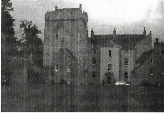
Pictured: Kilravock Castle