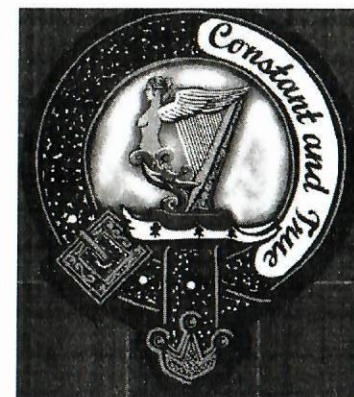
Pictured: Clan Rose International Crest

Clan Rose International (“CRI”) is an International Non - Governmental Organization (“INGO”) whose mission is to promote and research Norman and Scottish heritage, as well as to function as a resource for all persons being a part of, and/or descended from the Scottish Rose Family