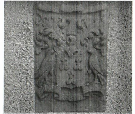
Pictured: Constant and True Motto with the Rose Coat of Arms on wall at Kilravock Castle