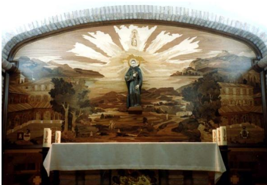
Chapel of St. Ezekiel Moreno Shrine in Monteagudo, Spain.

To complete the Holy Month, before them we celebrate Saint Ezekiel Moreno (19 th of August) and after them, Saint Nicholas of Tolentine (10 th of September) . These two great saints represent the most important saints of the two other stages of the History of our Order.