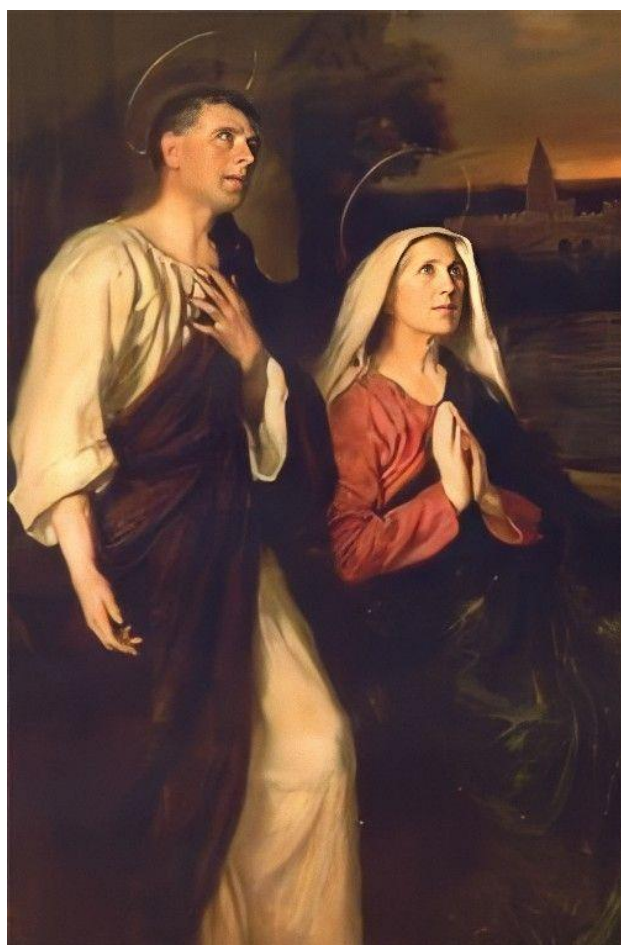
Ecstasy of Monica and Augustine in Ostia