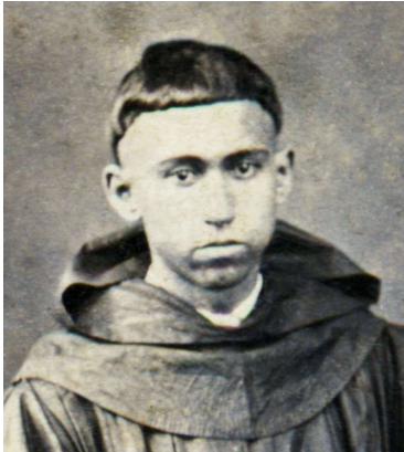
St. Ezekiel arrives to the Philippines