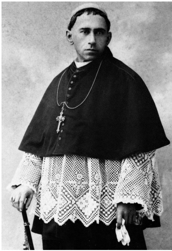
Bishop Ezekiel Moreno (1894)

Early in 1895 Ezekiel was appointed bishop of Pasto, Colombia. His life there would be characterised by the same dedication to duty in the service of the Church and for the salvation of souls, the only thing that mattered to him. His own profound interior life, always directed towards God, and his love of contemplation attracted a group of like-minded souls around him. These he directed with clarity and wisdom along the paths of sanctity.