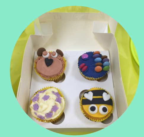
Entry Level 3 Cookery Module 3 - Cakes.

Cake creation and decoration are covered in this module where learners will go through a design cycle to create their own biscuits and cakes.