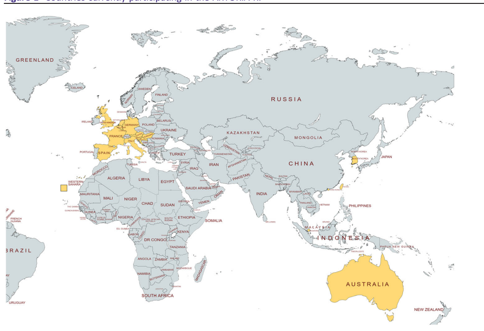
Figure 1 Countries currently participating in the ARTORIA-R.

The registry aims to achieve detailed information regarding the underlying congenital heart defect and the previous treatment of the patient. With this information, different cohorts [systemic left ventricle, systemic right ventricle, single ventricle (either anatomic left or right ventricle)] can be interrogated. Data will be collected about