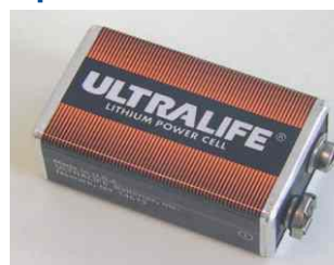
lithium long life bat. > 30 h measuring time