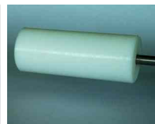
test module PE50R